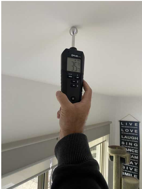
Moisture meter high reading below box gutters.