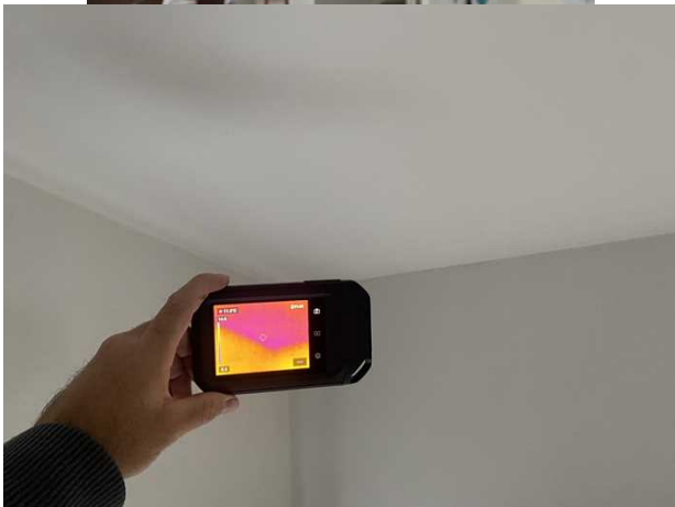
Thermal imaging moisture detected below box gutters.