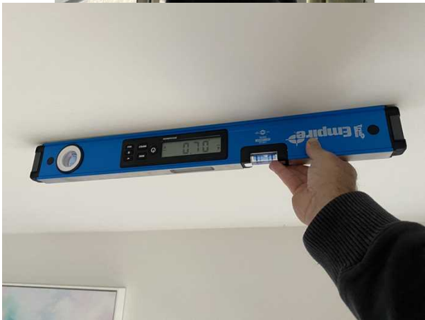
Plaster ceiling falling towards the kitchen/damaged area.