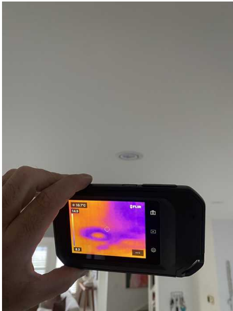
Thermal imaging moisture detected.