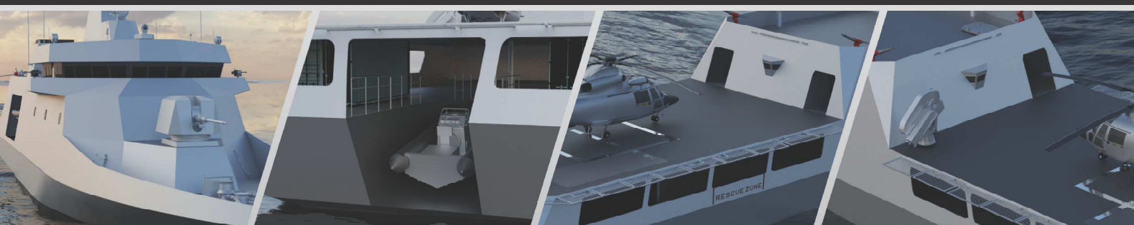
Customizable combat suite (Weapon & Sensors)

Optimized preset configuration but flexible to accommodate customer requirements