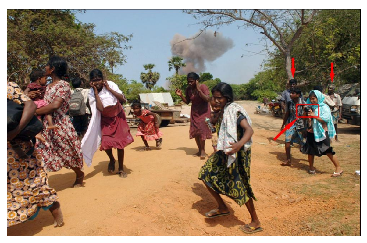
The actual photograph that was staged with a LTTE propaganda team photographing the scene. Note the camerawoman and her assistant smiling in the background.