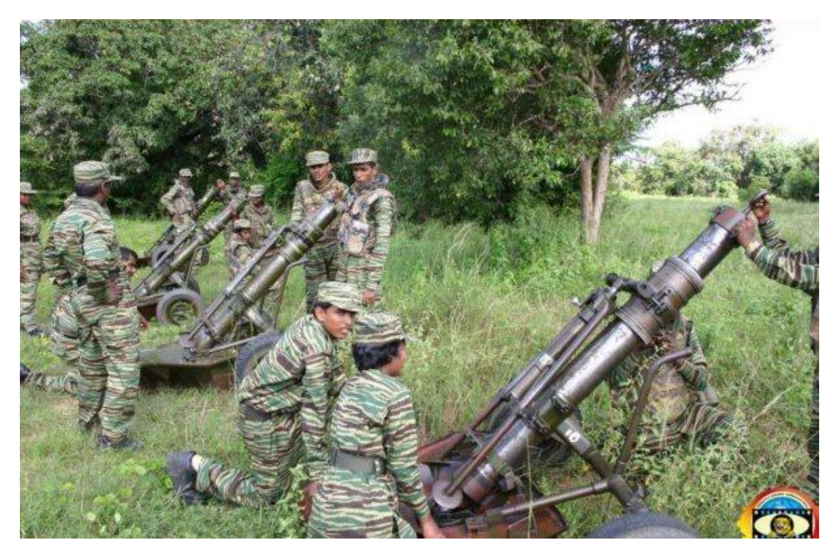
LTTE heavy mortar teams

Government of Sri Lanka or LTTE forces." 86 (Emphasis added.) That is to say that the United States government, with all the immense satellite and other technological surveillance facilities at its disposal, was unable to ascertain who was responsible for any shelling. In summary, therefore, the UN, the US government, UTHR and satellite surveillance was unable to ascertain whom was shelling whom in the "nofire zones". This fact is conveniently ignored by Channel 4 who apparently believe that they are in a better position to judge than the very people on the ground – and in the air – at the time.