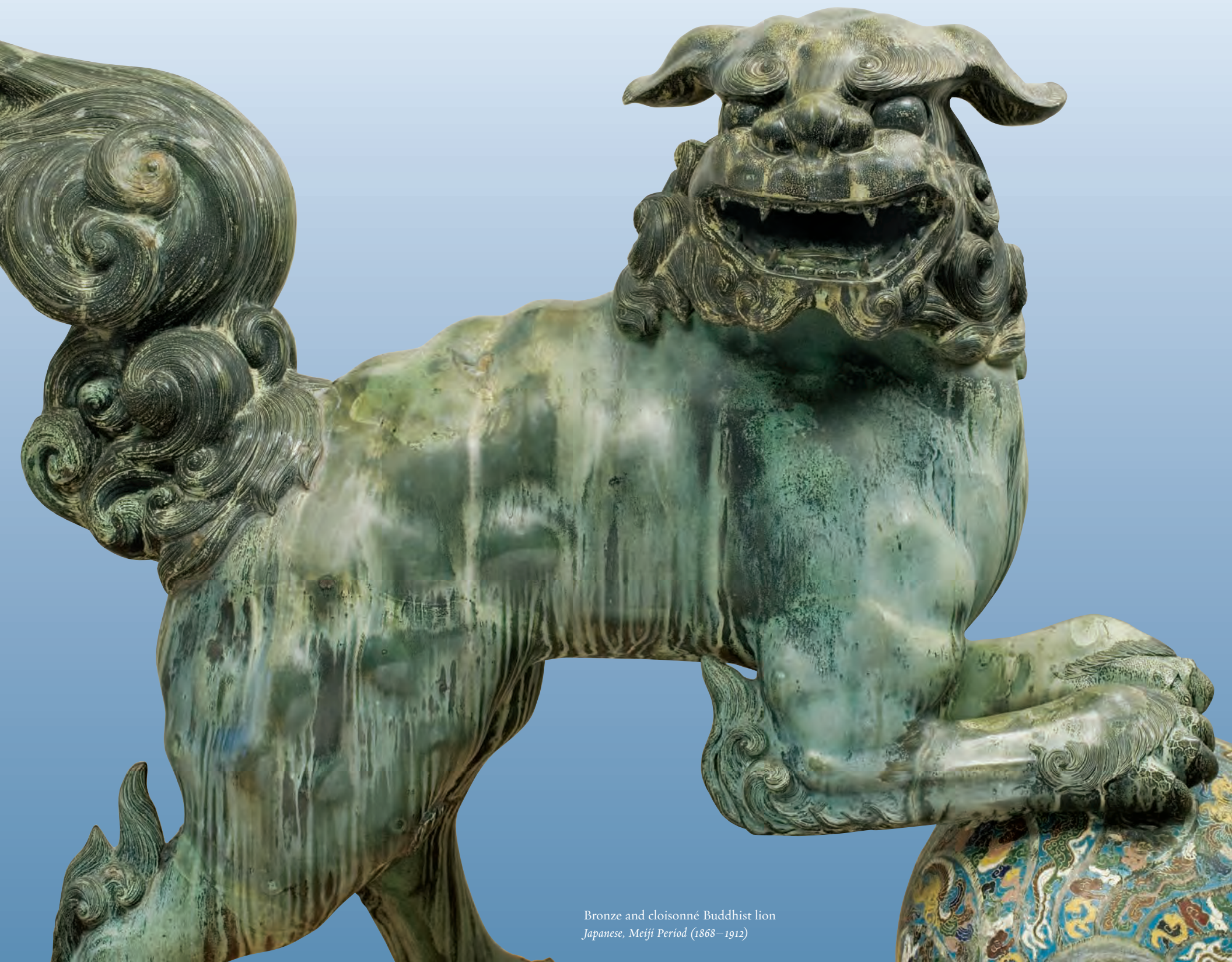
Bronze and cloisonné Buddhist lion Japanese, Meiji Period (1868–1912)