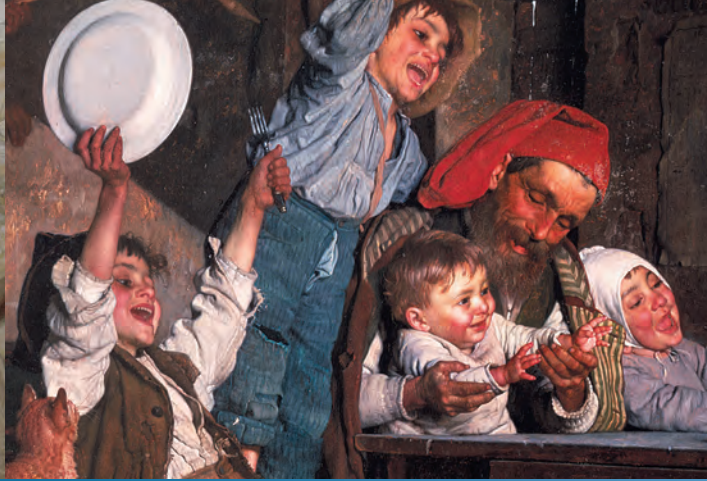
The Hasty Pudding, 1883 Gaetano Chierici (Italian, 1838–1920) Oil on canvas