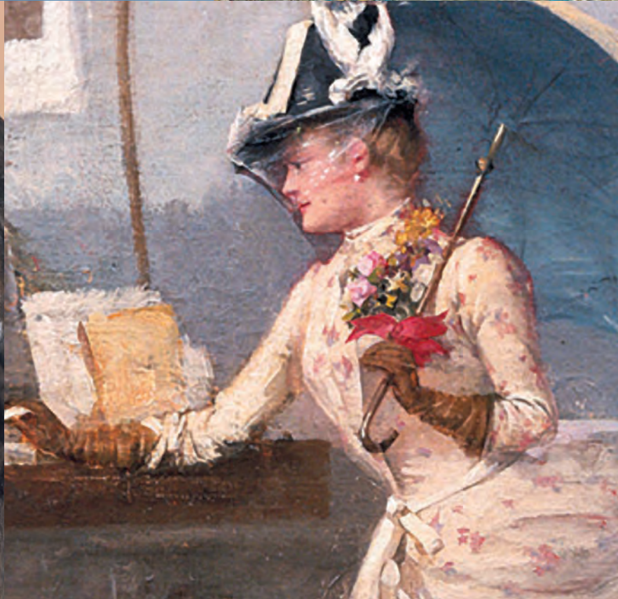
Un Coin des Quais à Paris, 1886 Hy Walker d'Acosta (19th Century)