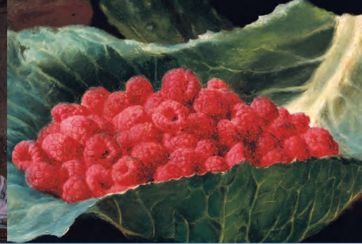
Raspberries on a Leaf, 1858 Lilly Martin Spencer (1822–1902) Oil on wood panel