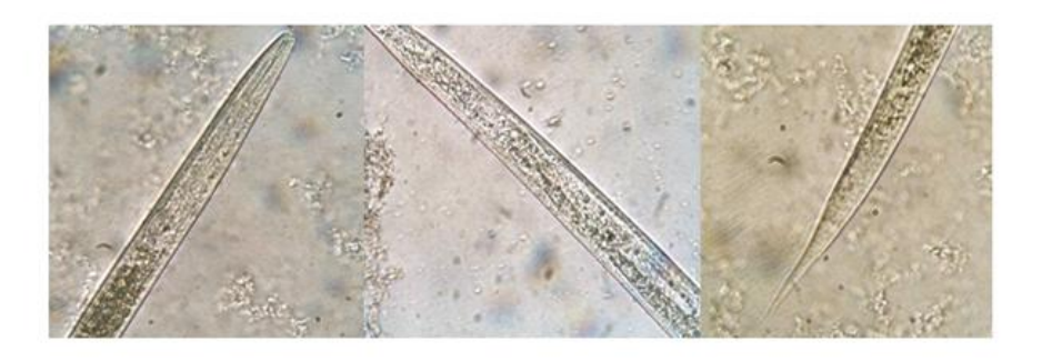
Fig. 4: Strongyloid larvae removed from Parmacella ibera of Fereidounkenar (400×)

In all examined slugs for nematode larvae infection, P. ibera (7.69%, 1/13) was found to be infected with Strongyloid larvae with average length of body in 197±12.15µm and pointed tail with average length of 23±1.37µm from Fereidonkenar area in spring 2012 (Table 1) (Fig.4).