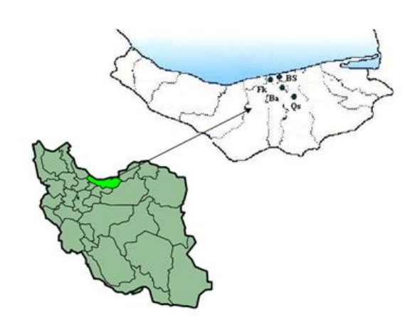
Fig. 1: Map of North Iran showing the municipalities with samples of Parmacella ibera and Limax keyserlingi examined for nematode larvae (Ba, Babol; Bs, Babolsar; Fk, Fereidonkenar; Qs, Qaem Shahr)

Mazandaran province is located in north of Iran (50° 34'E, 36° 47' N) with average rainfall of 700 mm, temperature 17°C, and humidity 79-80%. The province has four distinct seasons: cold season (January to March), spring (March to June), summer (July to September), and fall (October to December). The area of study is semi temperate with wet climate that divided into four sub-areas, i.e. Fereidonkenar, Babolsar, Babol, and Qaem Shahr (Fig.1).