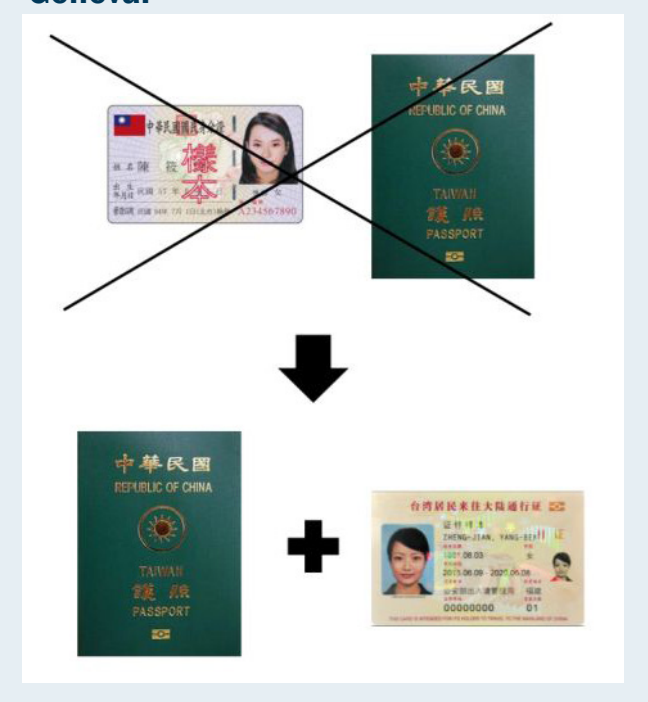
Figure 3. Mock-up of Internal UN Documents Regarding the Entry of ROC Citizens in UN Facilities in Geneva.

Source: Elson Tong, "<u>Not just officials: Taiwan students blocked from visiting UN public gallery in Geneva</u>," Hong Kong Free Press, June 15, 2017.