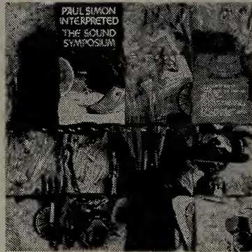
PAUL SIMON INTERPRETED —Sound Symposium—Dot DLP 3871/25871

The Boston Pops Orchestra, under the leadership of Arthur Fiedler, interprets twelve tunes associated with the American west. In brisk, lively fashion, the Orchestra romps through "Deep In The Heart Of Texas," "Sweet Betsy From Pike," "The Streets of Laredo," and Cole Porter's "Don't Fence Me In." There should be plentiful middle-of-the-road play in store for this bright package.