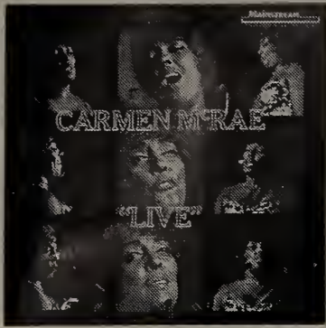
'LIVE' AND WAILING —Carmen McRae—Mainstream S 6110

This is sort of a "Best Of" set, since Carmen McRae is captured live on 9 potent songs she's long been associated with. The vet jazz lark turns in exciting performances on "Perdido," "Love Is Here To Stay," "Too Close For Comfort" and "Traveling Light." Should be lots of good things in store for this set.