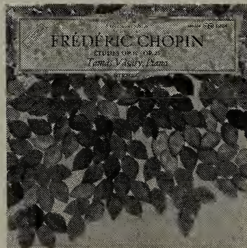
FRÉDÉRIC CHOPIN: 24 ETUDES, OP. 10 & OP. 25 —Tamas Vasary—Deutsche Grammophon 136 454

Chopin wrote mostly for solo piano, but upon six occasions composed for piano and orchestra. His two concertos, "Fantasy On Polish Airs," "Andante Spianato & Grande Polonaise," "Variations On 'La Ci Darem La Mano,'" and "Krakowiak, Concert Rondo" are performed excellently on this three-record set by pianist Alexis Weissenberg and the Paris Conservatoire Orchestra, Stanislaw Skrowaczewski conducting. One piano solo piece, the "Polonaise Fantasie" is included.