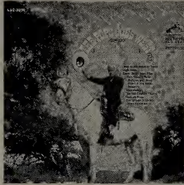
THE POPS GOES WEST —Boston Pops/Arthur Fiedler—RCA Victor LM/LSC 3008

This second album from composer John "Gentle On My Mind" Hartford could establish him as a folk/rock/country artist. Hartford blends all idioms as he looks at life: simple and complex, funny and tragic. "I Didn't Know The World Would Last This Long" is a lyrical look at living, while "The Girl With The Long Brown Hair" is an unusual love song. Other interesting items are "The Category Stomp" and "I'm Still Here." Could be plenty of sales in store for this set as the word gets around.