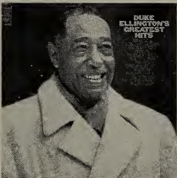
DUKE ELLINGTON'S GREATEST HITS —Columbia CS 9629

It has been 40-plus years since Duke Ellington cut his first record, and the multi-talented musician has been high in the public eye for every one of them. This collection contains 10 Ellington standards, most of which he had a hand in writing, and features vocals by Al Hibbler and Betty Roche, latter on "Take The 'A' Train," perhaps the Duke's best known piece. "Satin Doll," "Mood Indigo," and "Perdido" are also present. Anticipate strong sales.