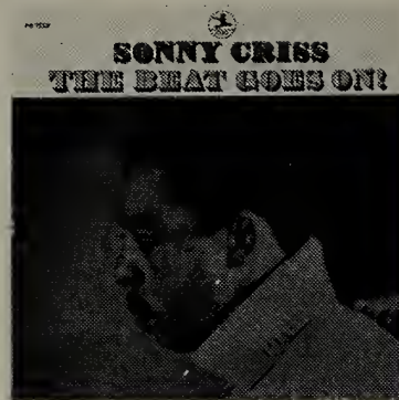
THE BEAT GOES ON! —Sonny Criss—Prestige 7558

It has been 40-plus years since Duke Ellington cut his first record, and the multi-talented musician has been high in the public eye for every one of them. This collection contains 10 Ellington standards, most of which he had a hand in writing, and features vocals by Al Hibbler and Betty Roche, latter on "Take The 'A' Train," perhaps the Duke's best known piece. "Satin Doll," "Mood Indigo," and "Perdido" are also present. Anticipate strong sales.