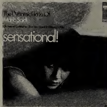
SENSATIONAL —Mario Said—Liberty LST-7562

The Sound Symposium, an instrumental combo, pays its respects to Paul Simon, of Simon and Garfunkel, who has written all the tunes on this LP. The music is permeated with classical overtones, and is performed with fluidity and grace. The selections include "The Sound Of Silence," "Bookends," "Scarborough Fair/Canticle," and "The Dangling Conversation." This set should enjoy brisk sales action in good music circles.