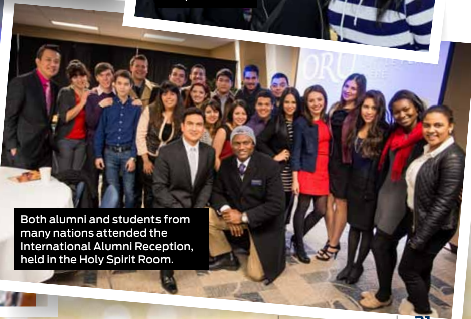
Both alumni and students from many nations attended the International Alumni Reception, held in the Holy Spirit Room.