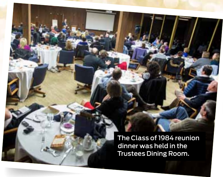
The Class of 1984 reunion dinner was held in the Trustees Dining Room.