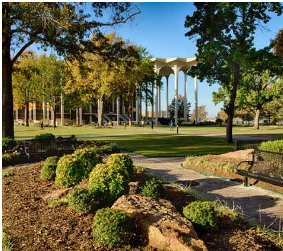
The ORU campus of 2014 is a photographer's delight.

Oral Roberts University exploded onto the scene during its first two decades. It didn't come passively; it skyrocketed.