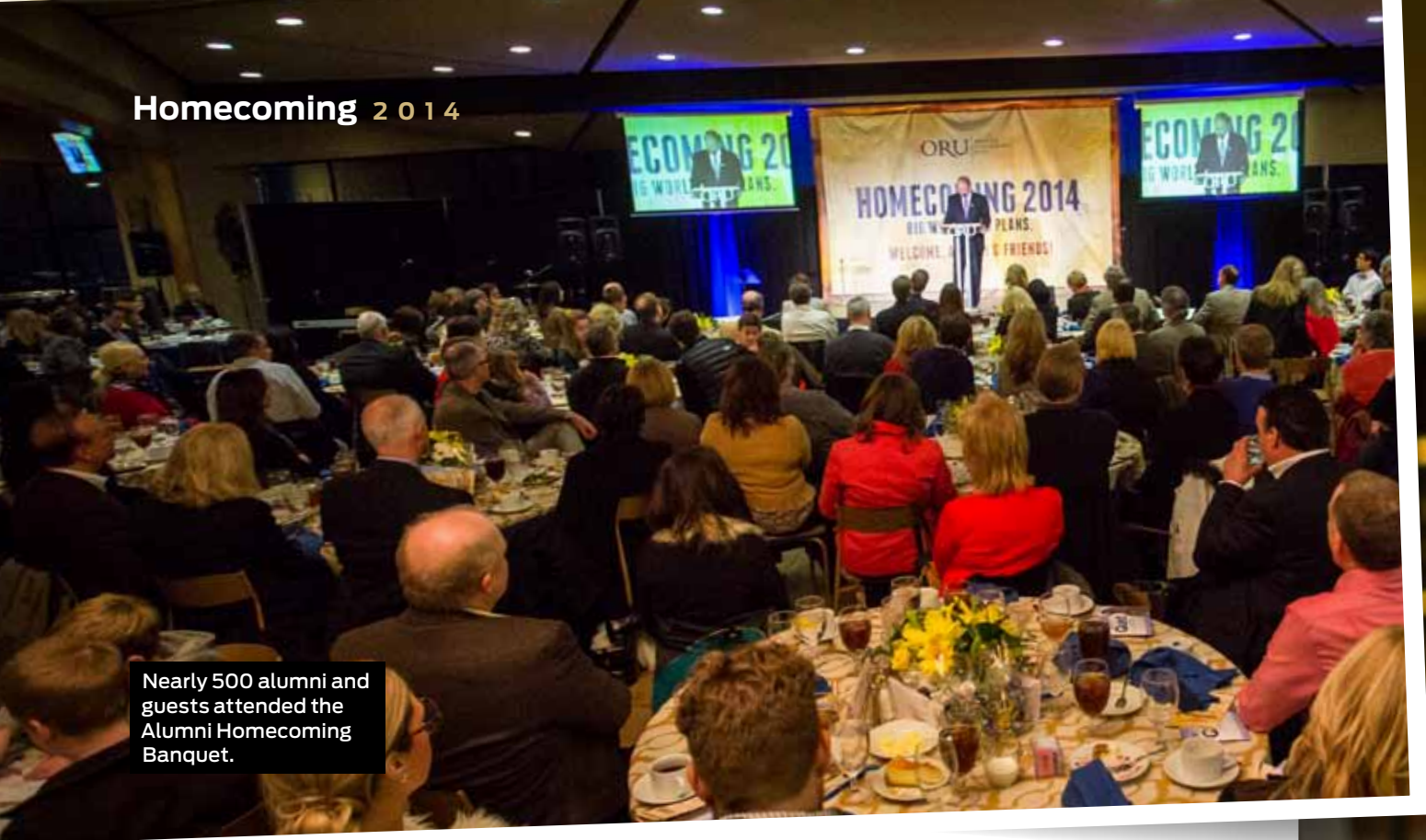
Nearly 500 alumni and guests attended the Alumni Homecoming Banquet.