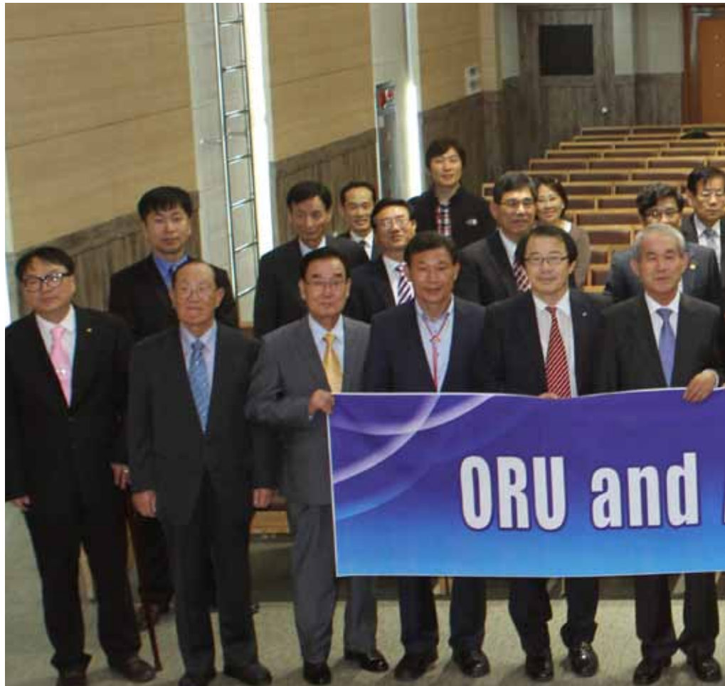
Representatives from ORU and Asia Life University celebrated the agreement to form an academic partnership.