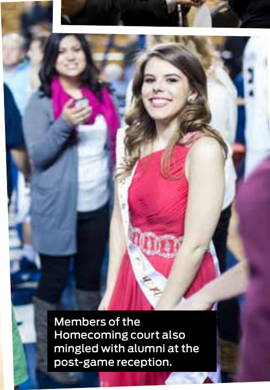
Members of the Homecoming court also mingled with alumni at the post-game reception.