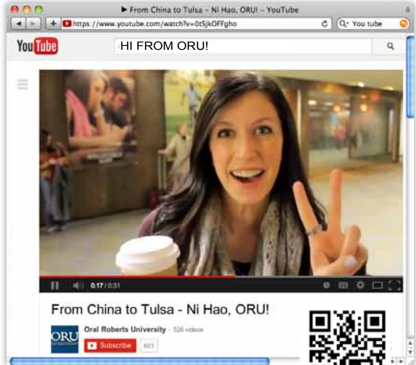
We launched our first-ever Mandarin Chinese class this spring! Watch ORU students say “Hi” in this language.

ORU is also developing a Mandarin Chinese minor; the first class was offered this spring. Students interested in this minor or in the other new degrees