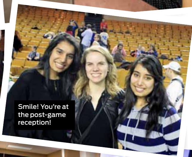
Smile! You're at the post-game reception!