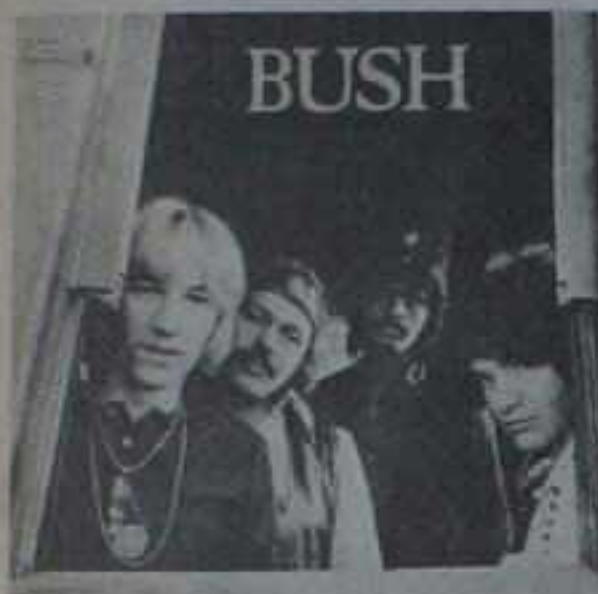
BUSH Dunhill DS 50086 (S)

This new Dunhill group is strong in blues rock, which still is a selling sound. This quartet offers 11 cuts, all of which are first-rate, especially "Back Stage Girl" and "Livin' Life." "Drink Your Wine," another winner, and "Cross Country Man" have notable instrumental sections. Three members of Bush assist on vocals with results worth listening to.