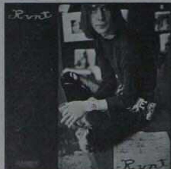
TODD RUNDGREN Runt, Ampex A 10105 (S)

This new Dunhill group is strong in blues rock, which still is a selling sound. This quartet offers 11 cuts, all of which are first-rate, especially "Back Stage Girl" and "Livin' Life." "Drink Your Wine," another winner, and "Cross Country Man" have notable instrumental sections. Three members of Bush assist on vocals with results worth listening to.