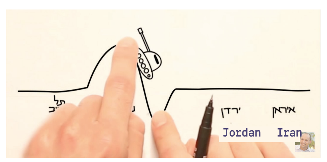
Screenshot from a video published by Bennett just before the 2012 elections, illustrating the unlikely scenario of Iranian tanks invading Israel

Even if Iran's outworn armored fleet were mobilized and sent a thousand of mile away towards Tel Aviv, the IDF would identify and destroy it long before it reached the border. Nevertheless, the Yesha Council (an umbrella organization of Jewish settlements in the West Bank) does not cease to warn us that without the settlements, a ground invasion from the east would begin "a lightning war that would start right in Israel's soft spot — deep within our home front". This is shameless public deception. The IDF will detect a ground offensive long before any tanks roll