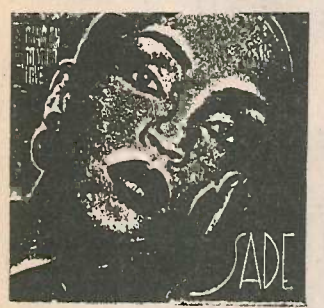
HANG ON TO YOUR LOVE Sade Portrait - 37-04664-H