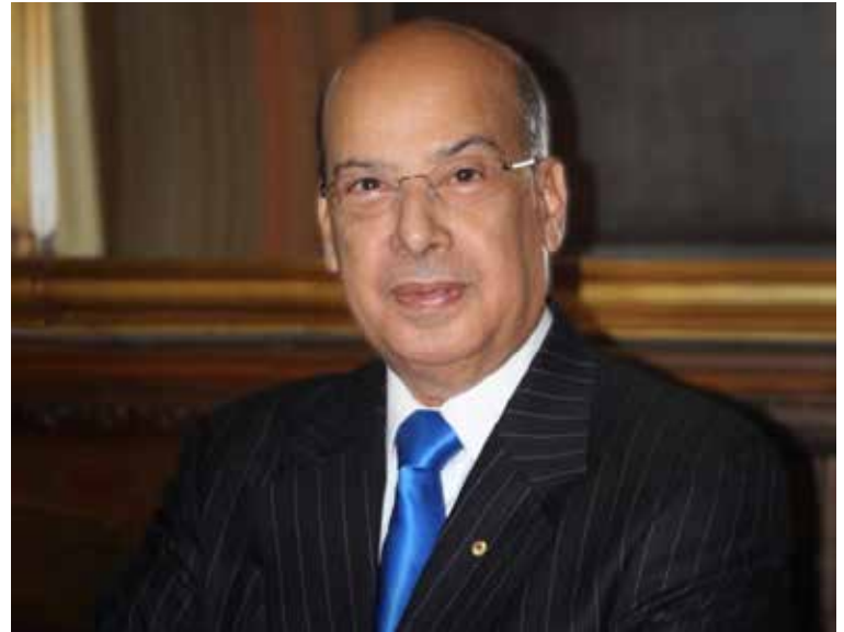
Sir Ronald Sanders

The Caribbean also grapples with a dual challenge: an influx of illicit firearms, primarily sourced from the United States, and a decrease in funding for crucial security initiatives.