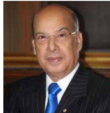
Sir Ronald Sanders

for Guatemala," stated Ambassador Sanders. "The controversy initiated by the Public Ministry against Arevalo and his party is serving to destabilize the new government before it starts. The OAS upholds the will of the electorate as freely expressed at the ballot box. This is a basic tenet of the Organization, and it explains why we are taking such a keen interest in being present to observe the installation of the new executive."