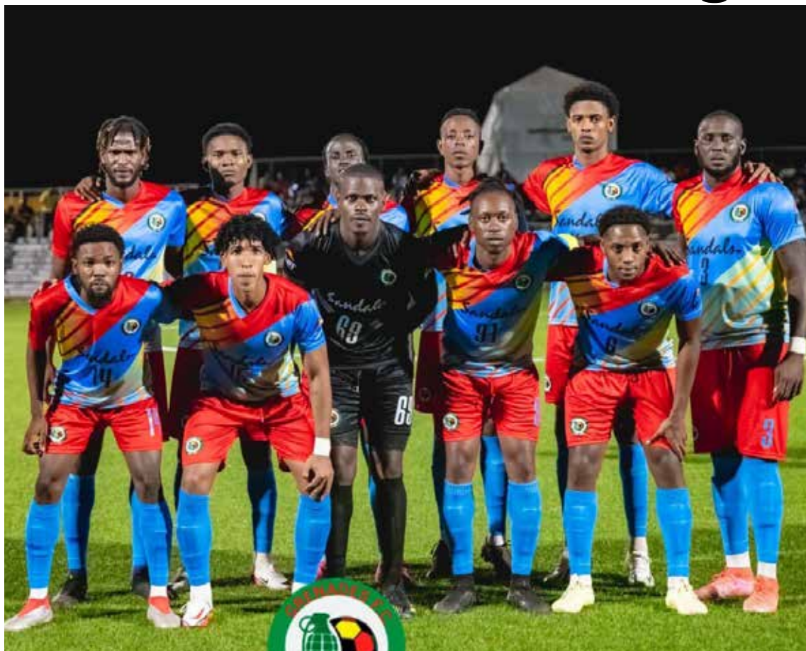
Players of the Sandals Inet Jennings Grenades team. (File photo) urday at 8 pm.

Old Road will be favourites to extend their perfect run against Swetes in the third and final match on Sat-