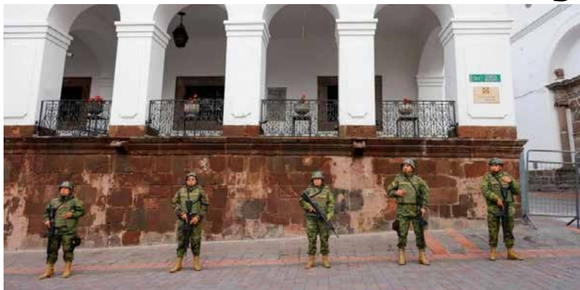
Soldiers were guarding the presidential palace in Quito on Wednesday.

One hundred and fifty-eight prison guards and 20 employees working for the prison system have also been taken hostage by inmates, officials said. An