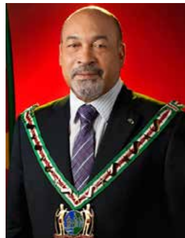
Former Suriname President, Desi Bouterse.

Bouterse led the country through the 1980s as head of a military government, then assumed office again in 2010, securing re-election five years later.