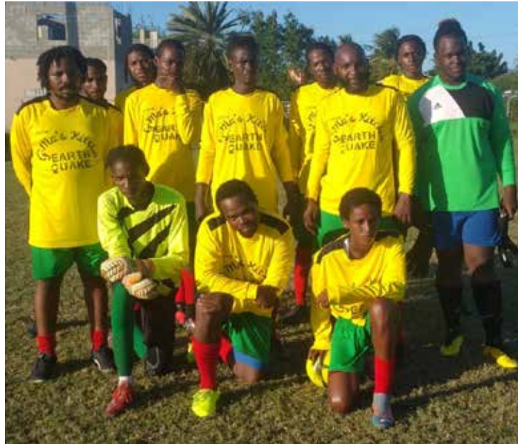
Players of the Earthquakes football team. (File photo)