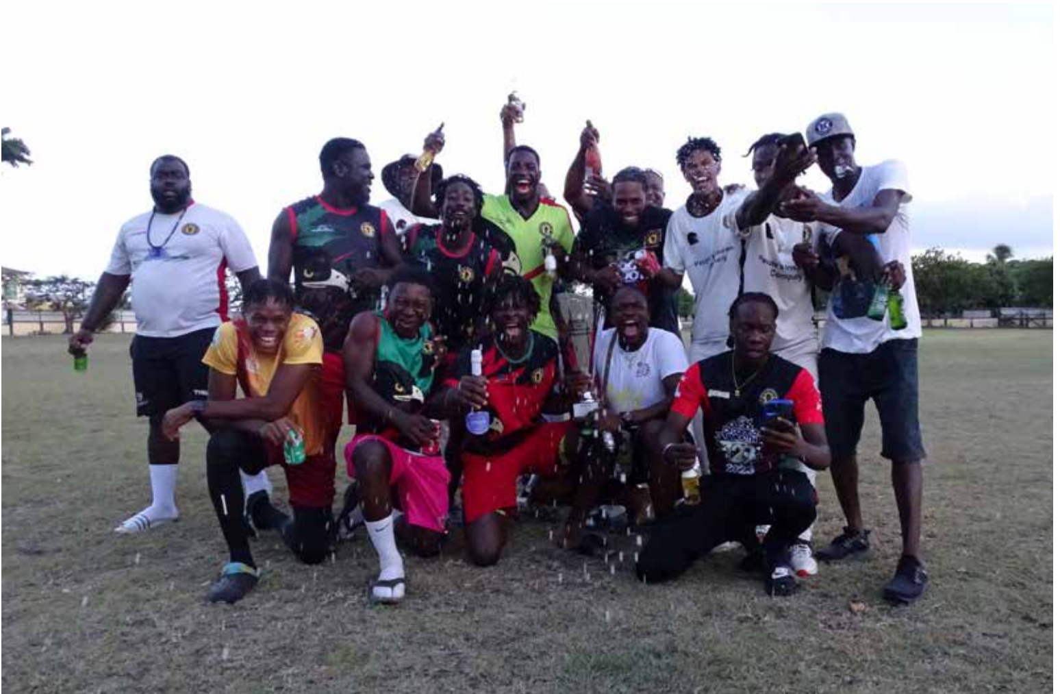
The Liberta Black Hawks celebrate after winning the ABCA Two-Day title last year. (File photo)