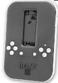
Asst. N7317 N6063