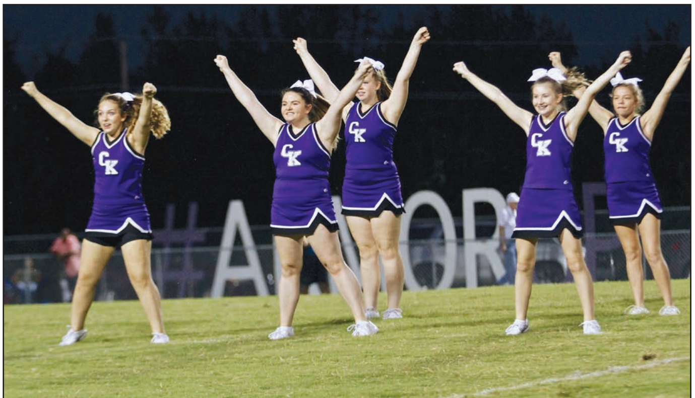
Some of the Centerpoint Junior High Cheerleaders at the Prescott game September 13

On September 20, Centerpoint's Junior Knights will play at Smackover at 7:00 pm with the seventh grade at 5:30.