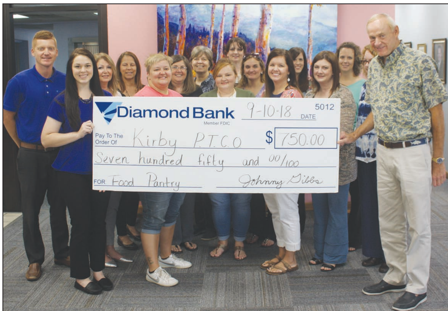
Four members of the Kirby Parent Teacher Community Organization came to the Diamond Bank in Glenwood on Monday, September 10, to receive a $750 donation from the bank for their proposed food pantry for students and their families. Donations of food can be brought to the school campus and monetary donations can be sent to the school at PO Box 9, Kirby, Ar 71950.

If you wish to make a monetary donation, make out your check to the PTCO, c/o Kirby Schools, PO Box 9, Kirby, AR 71950. All donations of money or food will be greatly appreciated.