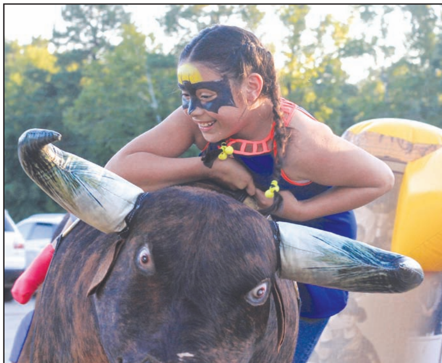
At the Latino Festival held Saturday, September 15, at the church on County Line Road, part of the festivities were face painting, mechanical bull riding and a wide range of excellent food. The Festival ran from 1:00 pm to 9:00 pm. See below a picture of the Mariachi Band, who entertained the crowds from mid afternoon onward.