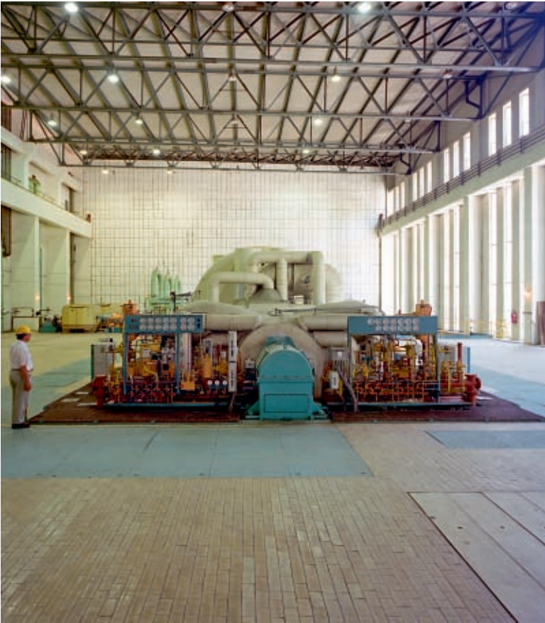
The Block-4 unit originally supplied by Siemens in 1972.