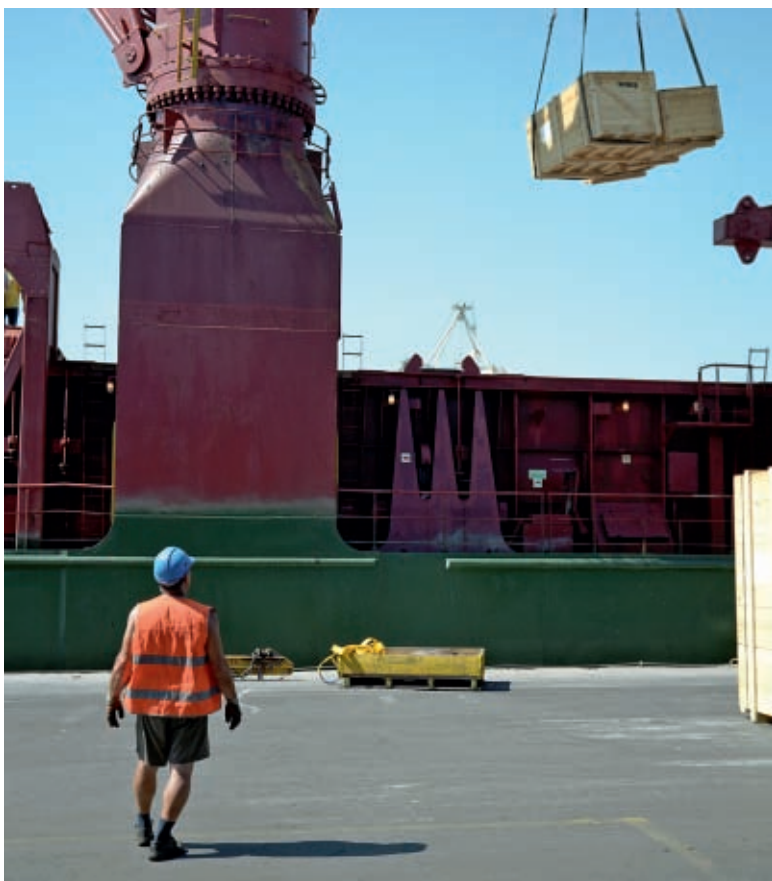
SGT-800 accessories being lifted from ship to shore