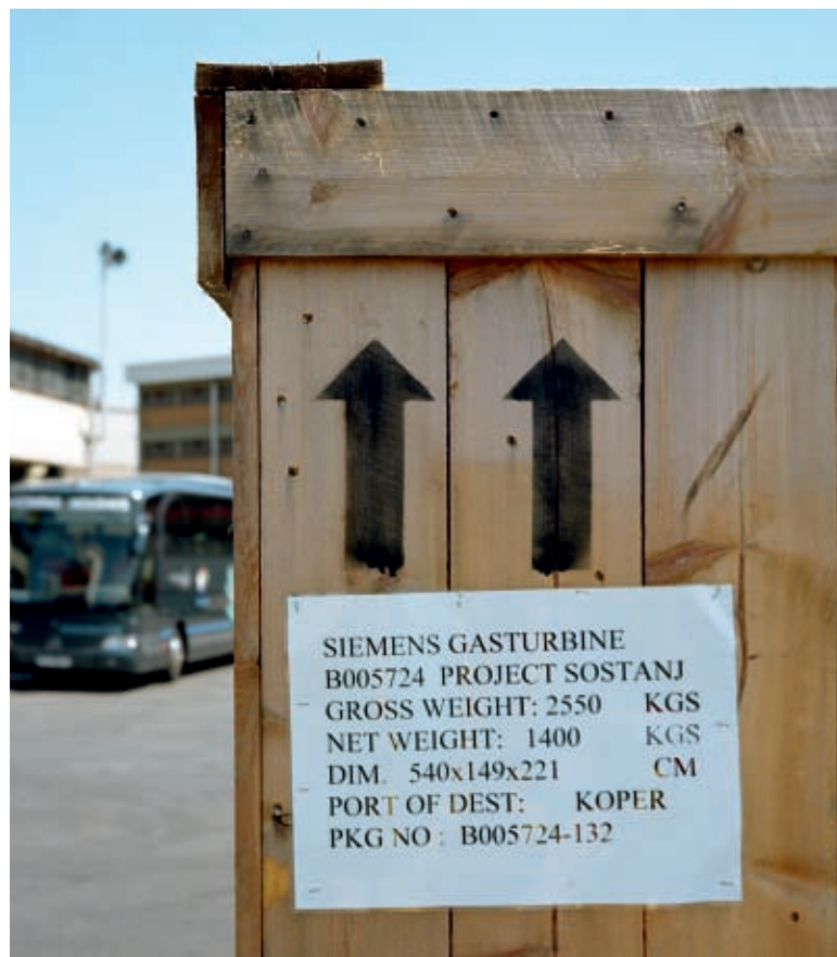
The first of two SGT-800's at its port of destination, Koper, Slovenia.

technology and the majority of the thermal generating plants are either approaching or well past their operational design life. As the basic fuel burned in these power stations, lignite is widely regarded as a 'dirty' form of coal with a relatively low heating value and can include concentrations of up to three percent of elemental sulfur. In addition to significant quantities of ash, particulates and nitrogen oxides (NO x ), the combustion process also produces high levels of carbon dioxide.