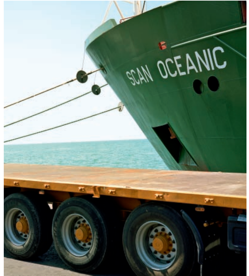
Moored and ready for offloading

Slovenia is a small Central European country on the northernmost part of the Balkan Peninsula, with a total area of just 20,273 km 2 , only slightly larger than the state of New Jersey in the US, and a population of around two million, fewer than in Paris, France. An Alpine country on the Adriatic coast, it is bordered by Italy, Austria, Hungary and Croatia. The most prosperous region of the former Yugoslavia, the country won independence in 1991, transforming its socialist economy to the capitalist free market. Slovenia became the only former Yugoslav republic to be in the first wave of candidates for membership of the European Union, joining both the EU and NATO in 2004 and on January 1st 2007 becoming the first new EU member state to join the eurozone. In the first half of 2008, Slovenia will take over the EU's rotating presidency.