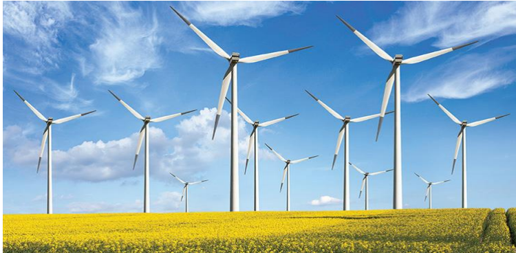
Aysha III Wind Power Project