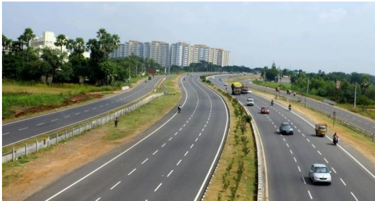
Adama Awash Expressway