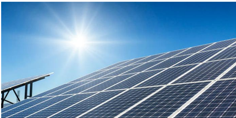
Gad Solar PV Project-Phase 1