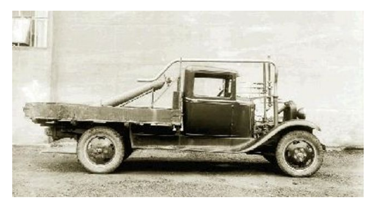
Pickup truck of the Norsk Hydro Company, converted to run on hydrogen gas.

Another almost forgotten fact is Sikorski's experimentation with hydrogen-powered engines in helicopters. After building fixed-wing and rotary-wing aircraft in Russia, he fled to the USA in 1917 during the Bolshevik Revolution. Other Russian immigrants helped him financially to organize the Sikorski Aviation Research firm in 1938. Igor Ivanovitch Sikorski was able to persuade the US government to front a two million dollar budget for further trials on vertical take-off and landing aircraft (VTOL). He also proposed using liquefied hydrogen as a fuel for aircraft.