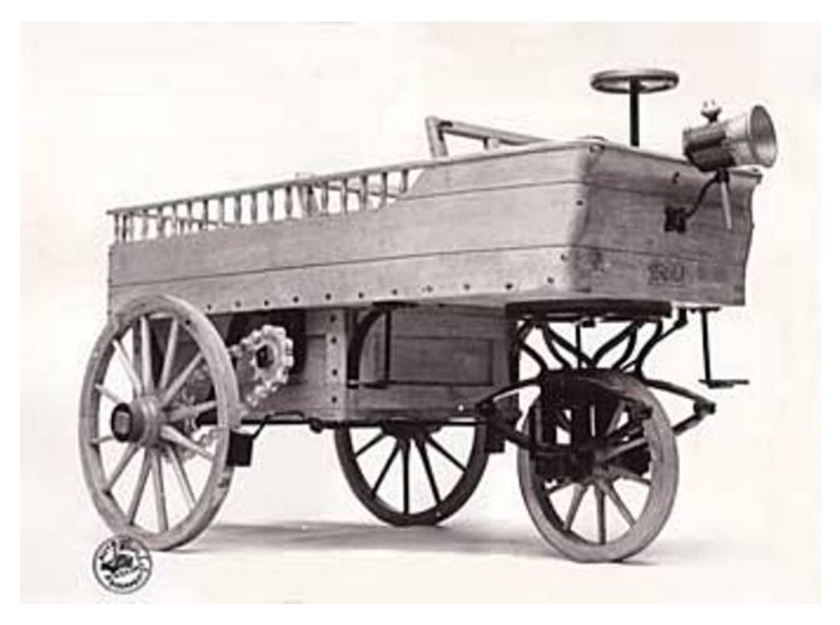
A replica of Lenoir's "Hippomobile", the very first 'flex-fuel' pickup truck. Illustration courtesy of the Louvre, Paris.

In part one of this series, I listed the exploits of Rivaz, but skipped Lenoir. Etienne Lenoir patented his two-stoke engine in 1860, and he installed it in a three-wheel wagon, named the "Hippomobile", because its fuel -- hydrogen --, was electrolyzed from water. French humour, I guess. He later experimented by running his engine on different fuels, coal gas among them – the very first flex-fuel engine. (Is there absolutely nothing new under the sun?) Lenoir built and sold almost 400 of these engines, competing successfully with steam engines of the time.