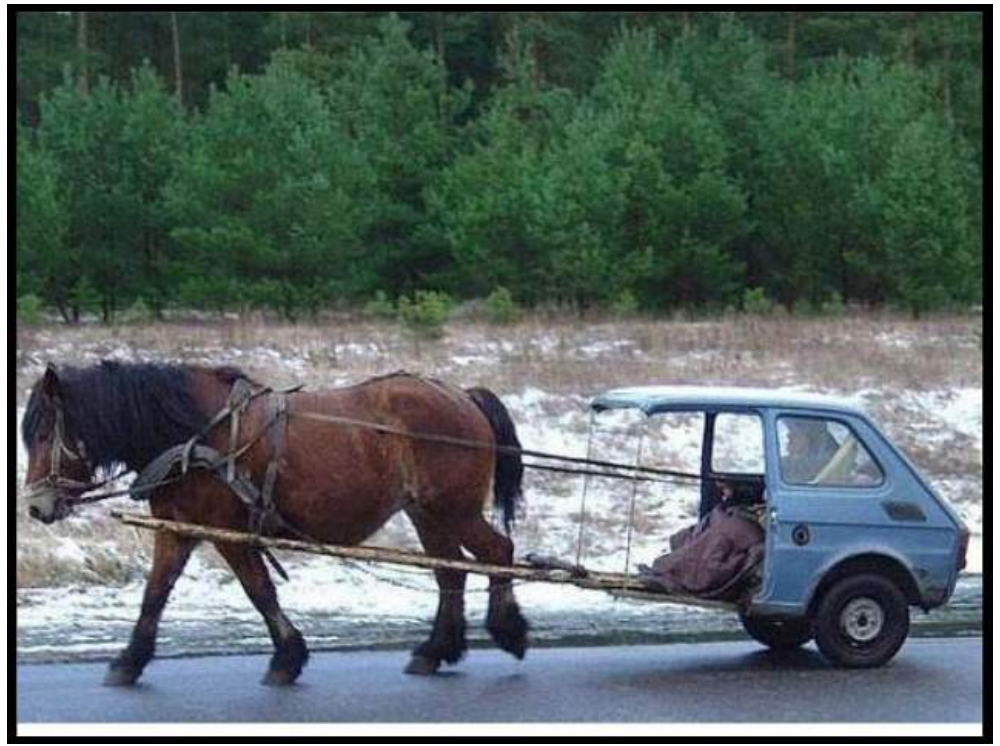
Not the 1800s, and not a horse-less carriage, but a transportation method in a developing country. Illustration courtesy of Auto Bild.

Horses in such vast numbers left a lot of pollution in liquid and solid form on every street they worked and travelled on, potentially attracting rats and insects, and thus spreading diseases. Reports from America's largest city inform us that up to 2,000 tons of horse manure had to be removed from the city's streets on a daily basis. Yes, I searched for and read the reports, and I also checked the math.