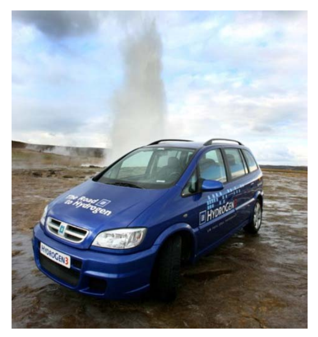
A modern FCV prototype in front of one of Iceland's geysers.

Dr. Arnason claims that Iceland's future will look much like its past: "When the Vikings settled in Iceland, they used only renewable energy like wind, sun and wood. The Icelanders were the 'first solar-energy civilization' -- and so was the whole world. Now we are finding our way out of the fossil-fuel era, back into the 'second solar-energy civilization.' And, in the end, the same will also be the case for the rest of the world."