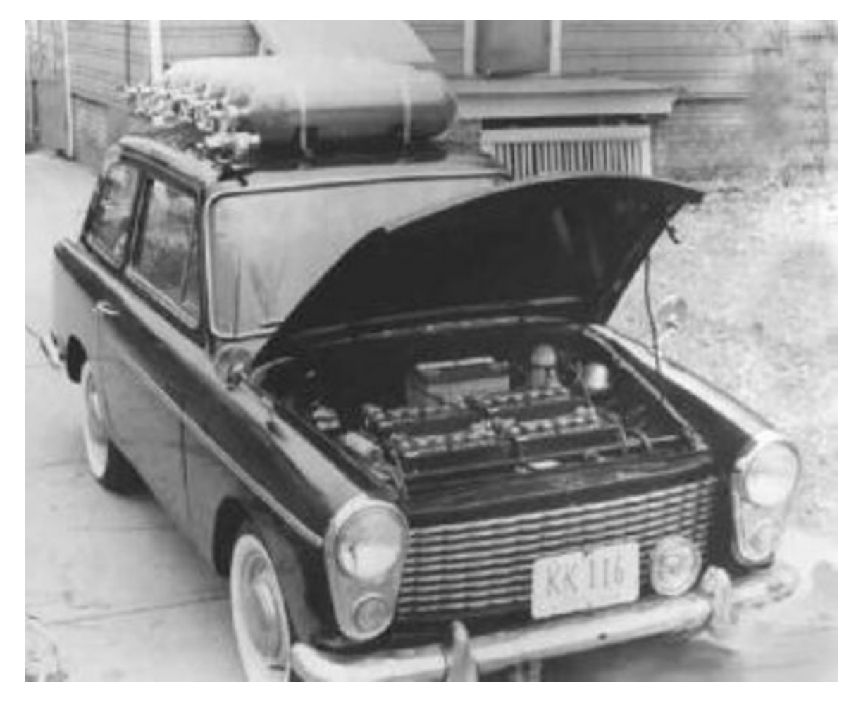
A battery of batteries under the bonnet (hood) of the Austin A40.

In 1970 Kordesch took his Austin A 40 and used it as an FCV "mule", today's term for experimental prototype vehicles. He sacrificed the Austin's trunk to hold the fuel cell, and six roof mounted tanks held the hydrogen at a much lower pressure than what can safely be used today. He installed a group of lead-acid batteries in the engine compartment, under the bonnet, as the British say. With that, the "Austin FCV" had a range of about 300 km (180 miles). Kordesch drove that Austin on a regular basis for three years, commuting to and from work, going shopping, being looked upon and tolerated by the public as just another 'mad scientist' in his home town of that time.