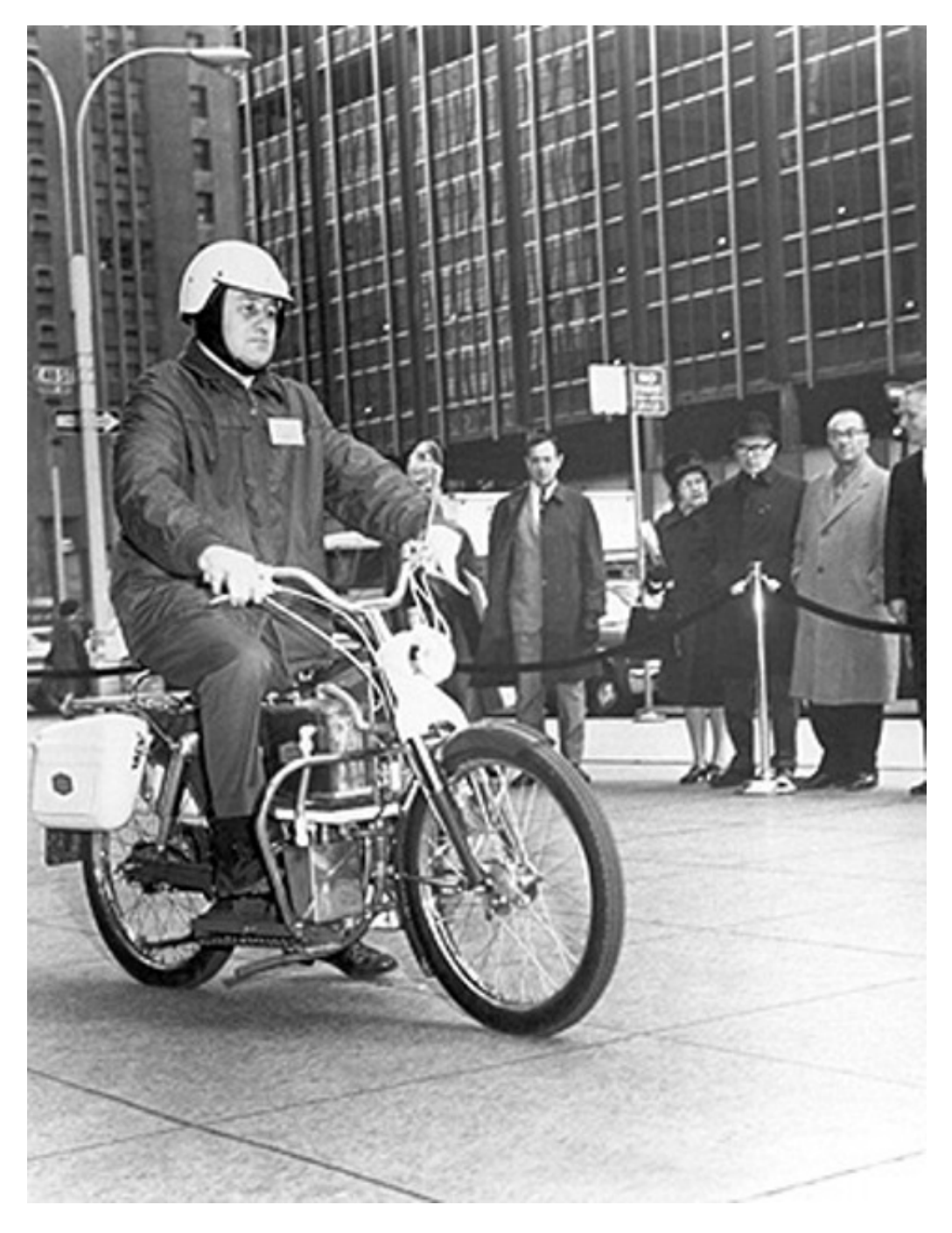
Dr. Kordesch on his way to work in Boston. Original Union Carbide caption: "It looks like an ordinary motorbike but there's no internal combustion engine and there's no noise. The machine, which is powered by a hydrazine-air fuel cell system, was built under the direction of Union Carbide's Dr. Karl Kordesch (pictured), a pioneer in fuel cell development. Dr. Kordesch has run up over 300 miles on the motorbike which can do 25 miles an hour and can travel 200 miles on a gallon of hydrazine."