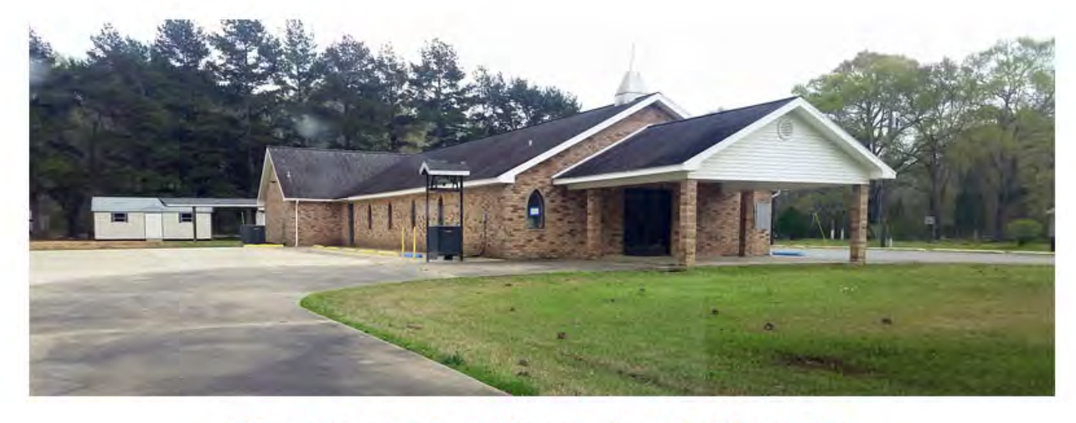
First Baptist Church of Oberlin March, 2018