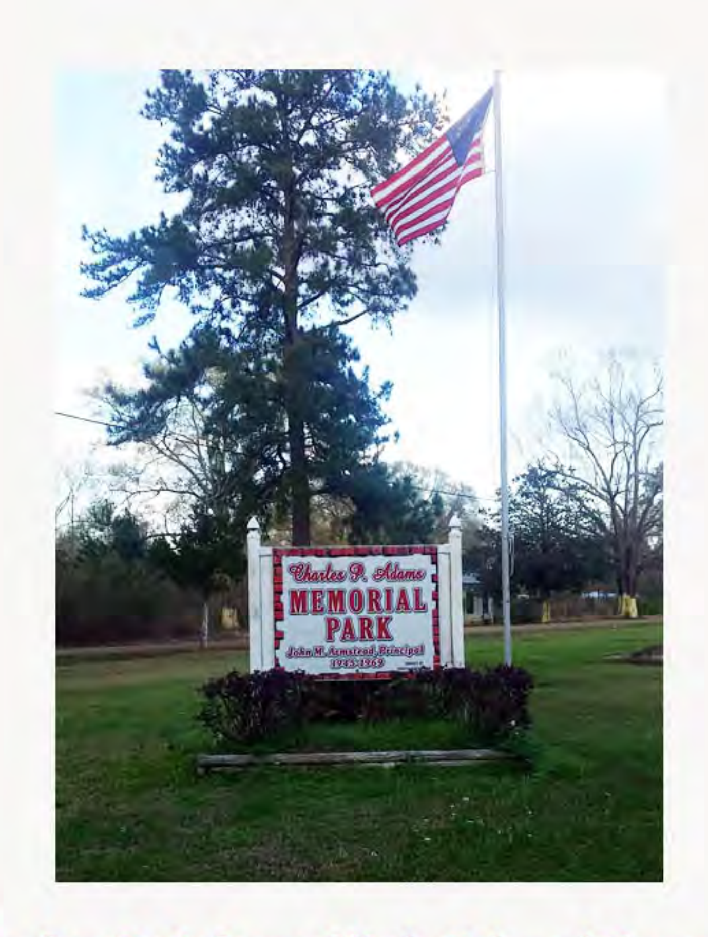
Charles P. Adams High School Campus March 1, 2018