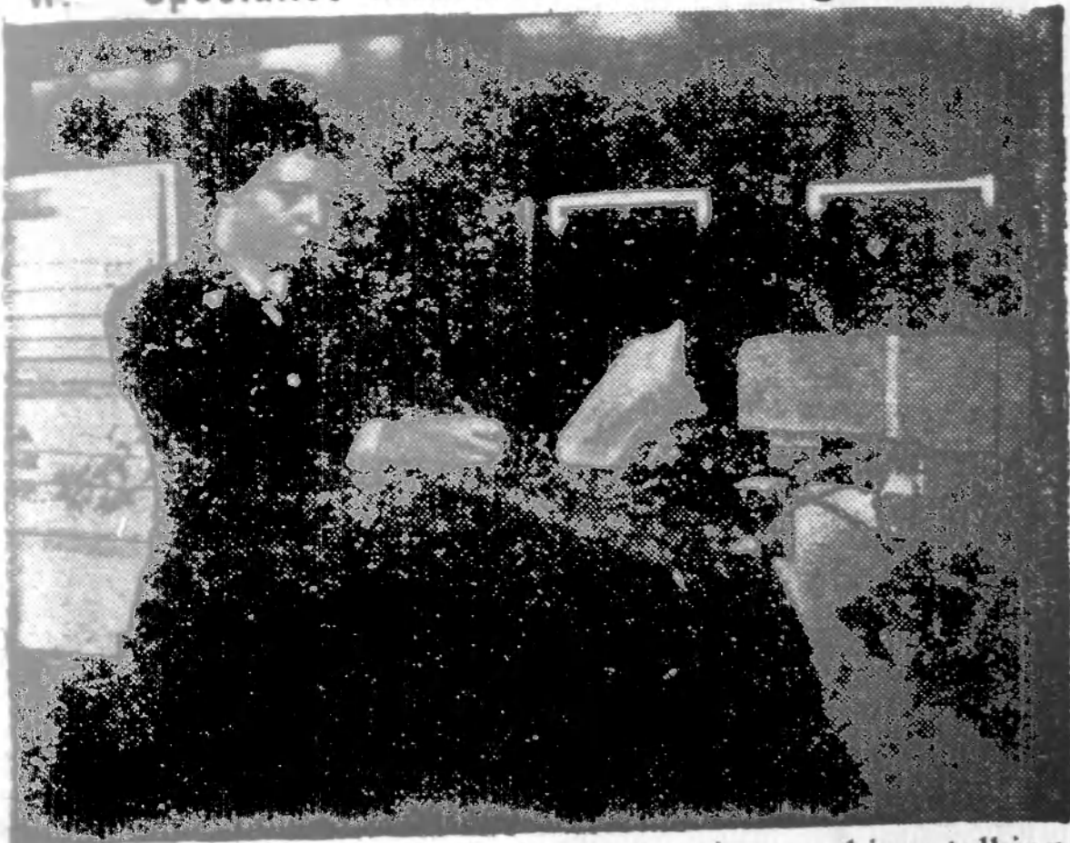
FAST TALK —Automatic data-processing machines talking a punchcard language in microseconds at the bidding of a Women's Army Corps specialist. This expert is one of the many young women of the Corps who receive invaluable training while building a rewarding career. Local Army recruiters have details about how to apply for the many immediate openings for this type of assignment.

Specialist Monitors Fast Talking Machine