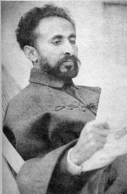
2. Emperor Haile Selassie around 1941