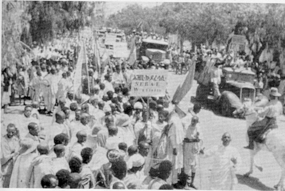
5. Unionists from Serae province march to meet the Four Power Commission