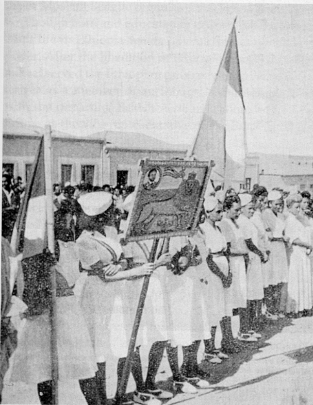
6. Women unionists demonstrate for reunion