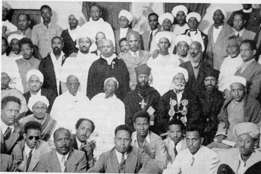
4. Unionist Party meeting