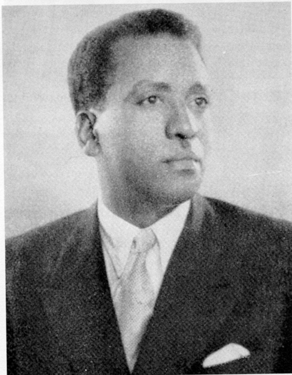
8. Tedla Bairu, the first chief executive of the government of Eritrea

Photos nos. 1-2 from My Life and Ethiopia's Progress 1882-1937 , autobiography by Emperor Haile Selassie (1973); nos. 3-4 from Ethiopia: Liberation Silver Jubilee, 1941-1966 ; nos. 5-8 from Ethiopia and Eritrea: The last phase of the reunion struggle 1941-1952 by S. and R Pankhurst (1953)