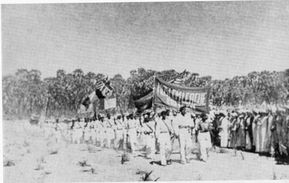
7. Demonstrations by the Moslem League