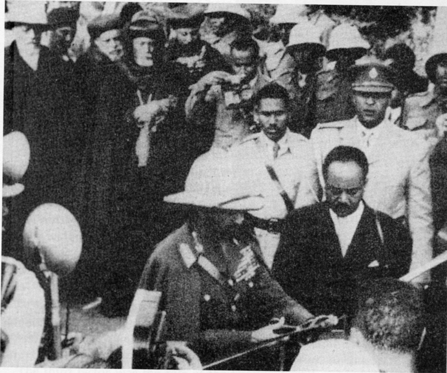
3. Emperor Haile Selassie on Mareb River heralding Federation