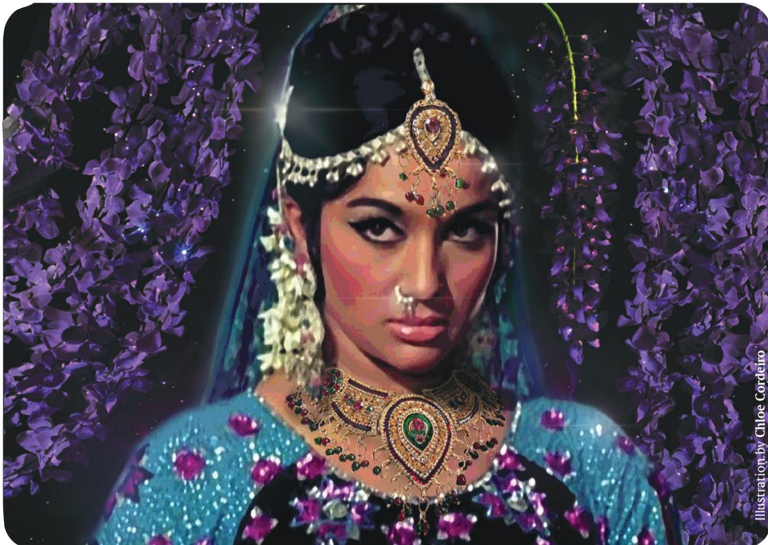
Illustration by Chloe Cordeiro

Cinema is deeply embedded in Indian public life and popular culture – walk past a wedding ceremony or temple festival and you will hear 'hit' film songs being played on loudspeakers. Street art overflows with references to current heart-throbs, names of films and the dialogues that become catch phrases and symbols for more. Atul