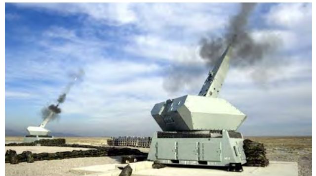
German C-RAM system Mantis currently in use.

The Counter Rockets Artillery and Mortar (C-RAM) is a set of systems used to detect and destroy incoming rockets, artillery and mortar rounds in the air, before they hit the ground. This multinational High Visibility Project 3 aims to develop and procure such counter rockets, artillery and mortar capabilities that are mobile and can be rapidly deployed to protect troops and at risk installations.