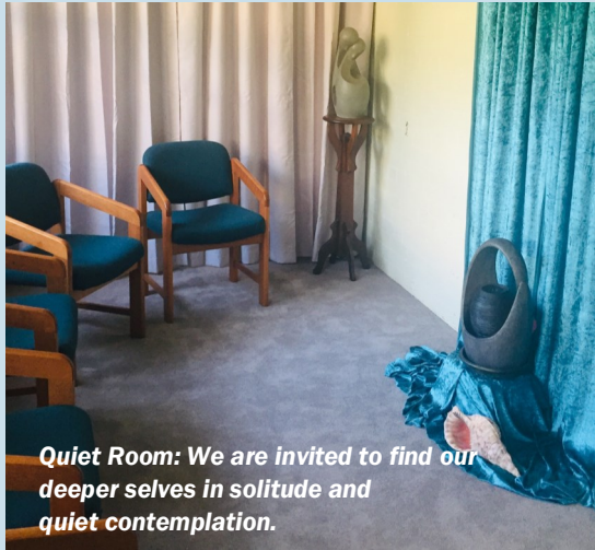
Quiet Room: We are invited to find our deeper selves in solitude and quiet contemplation.

SYCHAR's rooms are set up to provide a variety of ways in which a seeker, anyone searching for deeper meaning in their lives, can find inspiration and support.