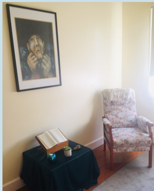
Companioning Room: Privacy allows for deep sharing of one's life experience with another so as to grow in awareness of God's presence.

Hospitality Area: Tea, coffee etc. and facilities for heating and serving food are available. Visitors are welcome to enjoy a simple cuppa alone or with others. Donations will help make this service available in an ongoing way.