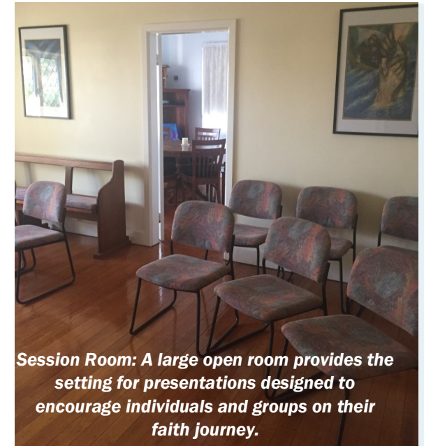
Session Room: A large open room provides the setting for presentations designed to encourage individuals and groups on their faith journey.

In order to preserve an atmosphere of serenity and peace, it would be helpful if personal belongings not in use be stored in the place provided.