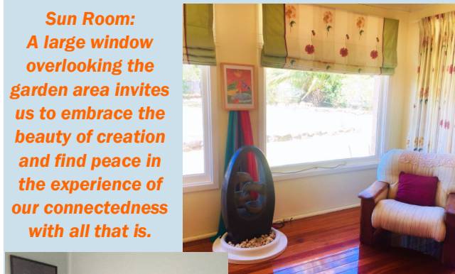
Sun Room: A large window overlooking the garden area invites us to embrace the beauty of creation and find peace in the experience of our connectedness with all that is.