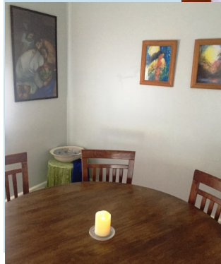
Meeting Room: A central round table highlights a desire that groups meet in an attitude of openness to the Spirit and each other.