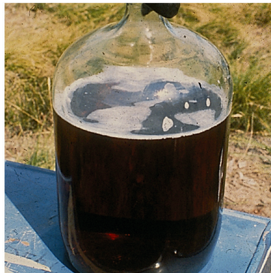
Chemical site groundwater in Muskegon County

The use of land use restrictions in lieu of full cleanup has left a legacy of contamination in place at locations across the state. As of August 22, 2023, EGLE's Environmental Mapper had recorded 4,244 land-use restrictions at 3,530 sites 8 (some sites have more than one restriction). The total surface area covered by the restrictions is 66,332 acres – cumulatively more than twice the size of the City of Grand Rapids. Soils and/or groundwater at most of these sites remain polluted.