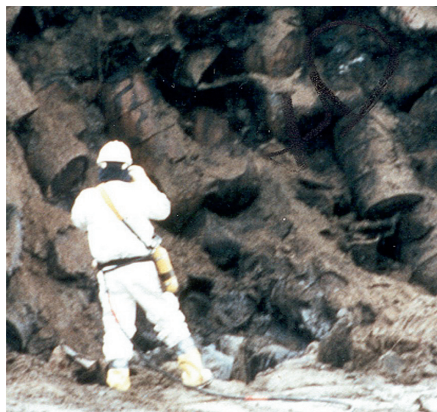
Buried drums in Lapeer County

Since fiscal year 1998, when Michigan voters approved an environmental bond that contained $335 million in public funds to clean up contaminated sites, the state has spent approximately $1.53 billion in taxpayer money for cleanup. This includes, in addition to former industrial and business sites, cleanup of thousands of leaking petroleum tanks that contaminate groundwater and cleanup of sites owned by the state itself.