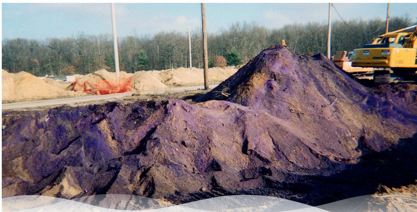
Contaminated soil in Muskegon County

cleanup criteria, and prohibited the agency from promulgating any rules that were more stringent than federal law. The latter was done at a time when the Trump administration reversed, revoked, or otherwise rolled back nearly 100 environmental rules, and federal environmental requirements were being systematically weakened, repealed, or were unenforced. The agency staff were so disheartened that 80 environmental professional employees cosigned a letter to Governor Rick Snyder advising him of the ill consequences of the legislative changes and requesting that he veto the legislation. He, nonetheless, signed the bill into law. 5