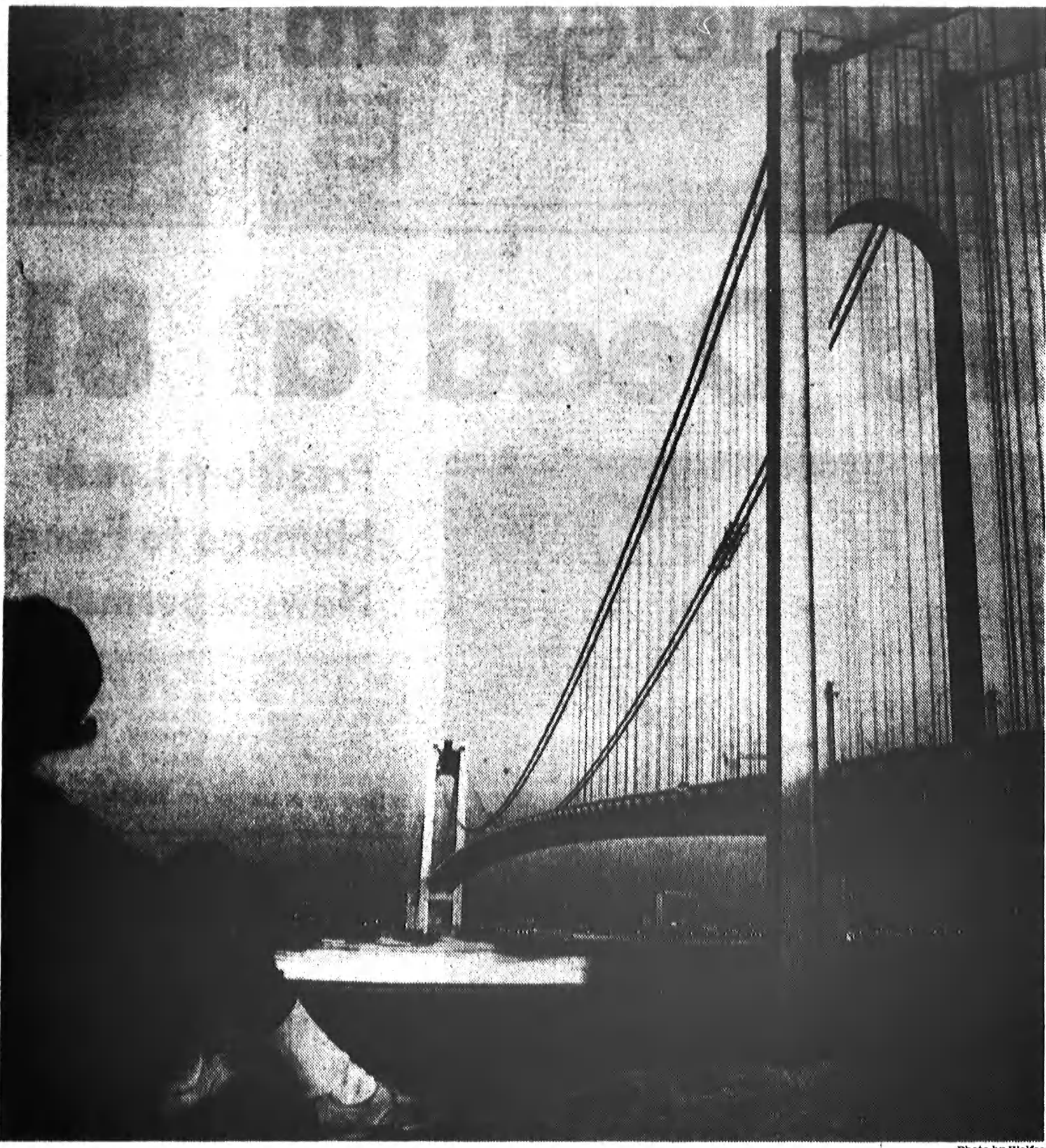
THE BRIDGE OF SIZE: Young lady gazes from Staten Island side at the beautiful Verrazano-Narrows Bridge.