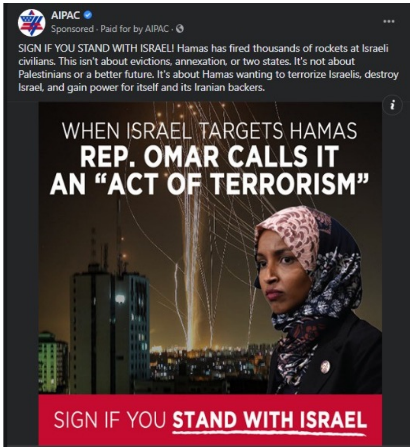
Figure 1 Twitter ad by AIPAC. Reprinted from Council on American-Islamic Relations, May 18, 2021, https://www.cair.com/press_releases/cair-calls-on-congressional-leaders-to-condemn-aipac-marjorie-taylor-greene-for-islamophobic-attacks-and-incitement-against-rep-ilhan-omar

Thus, it is hardly surprising that in 2021 AIPAC published a political ad defaming Rep. Omar as a “terrorist” for asking Secretary of State Antony Blinken whether international law protecting civilians should apply to all governments and armed groups equally, including the United States and Israel. 173 When a broad spectrum of Jewish groups published an open letter calling on AIPAC to retract its statements, which generated renewed death threats against the congresswoman, who is a Somali refugee and the only Muslim in Congress to wear a hijab, AIPAC doubled down. 174 Even staunch congressional allies of AIPAC such as House Majority Leader Steny Hoyer and Speaker Nancy Pelosi criticized the lobbying group for its incendiary rhetoric. 175 Hoyer stated “I disagree with the statements made by the members, but attacking them in ads does not advance the goal of increasing support for Israel,” while Pelosi said, “I don’t agree with Congresswoman Omar’s comments, but it’s very disappointing to see deeply cynical and inflammatory ads twisting her words.” 176