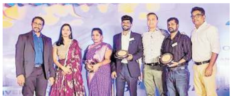
The third anniversary of Ramesh Neuro & Critical Care (RNC) Hospital was celebrated on Tuesday, marking their relentless commitment, groundbreaking thinking, and outstanding service to the healthcare industry. The recent inauguration of cathlab and endoscopy facilities in Block C has been another proud moment for RNC.

Apple Green Diamond, proudly announces its pivotal role in enhancing one of India's most sacred traditions. The revered Ram Temple, now boasts a crown adorned with exquisite gemstones, including multiple Emeralds and a unique Ruby, courtesy of Apple Green Diamond's "Diamondlite from Japan."