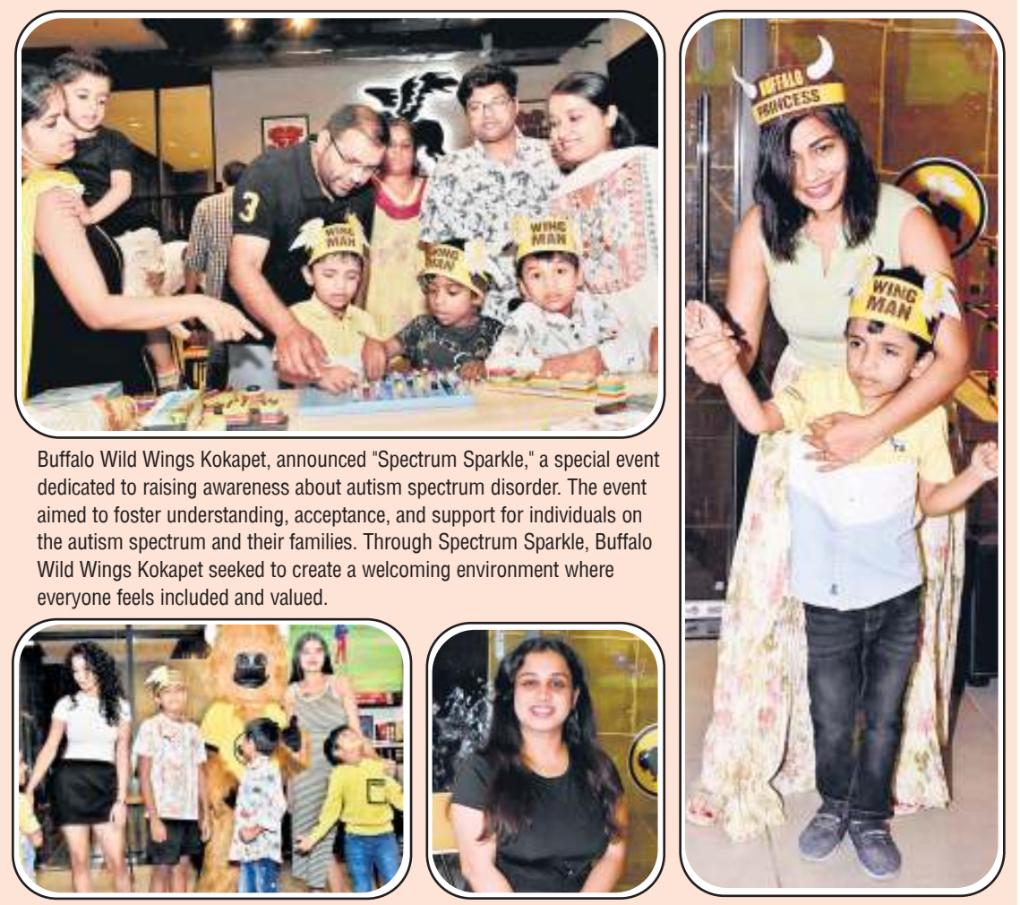
Buffalo Wild Wings Kokapet, announced "Spectrum Sparkle," a special event dedicated to raising awareness about autism spectrum disorder. The event aimed to foster understanding, acceptance, and support for individuals on the autism spectrum and their families. Through Spectrum Sparkle, Buffalo Wild Wings Kokapet sought to create a welcoming environment where everyone feels included and valued.