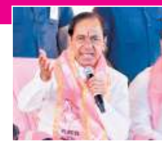
he says vote for the BJP.

people of Telangana would revolt. Survey reports are coming. Congress won't get more than two seats in the state.