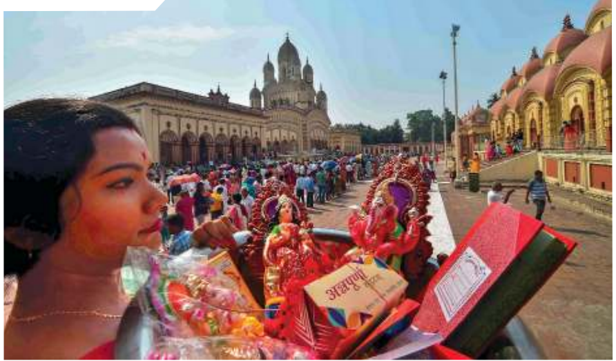
Devotees stand in a queue to offer prayers at Dakshineswar Kali Temple on Bengali New Year, in Kolkata