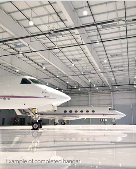
Example of completed hangar

Katrin Gist +1 206 292 6046 | katrin.gist@cbre.com | www.cbre.com/katrin.gist