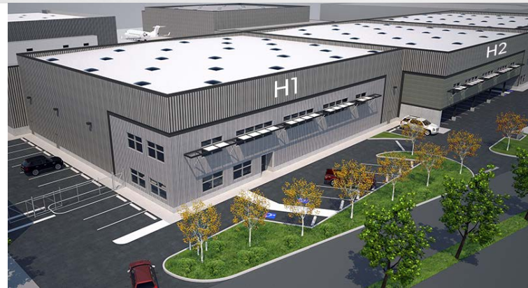
Hangar H1: 7757 Perimeter Rd South | Hangar H2: 7747 Perimeter Rd South

For private aircraft owners looking to own, these hangars could also offer an opportunity for subleasing any unused space. The market rate for leasing out 10,000 square feet of new hangar space at Boeing Field could be upwards of $20,000–25,000 per month.