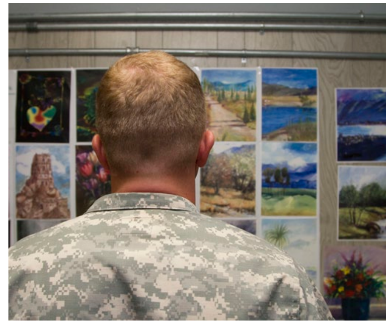
The officer-in-charge of the educational detainee program looks at the wall of detainee artwork. When detainees finish their work, they have the option to request the original.