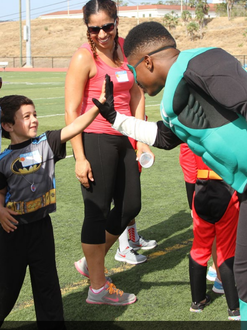
Batman and the Green Lantern high-five after successfully completing Spider-Man's Web Crawl during Super Heroes Field Day. Members of the JTF and NAVSTA community joined forces Saturday for the final event in April's Child Abuse Prevention Month.