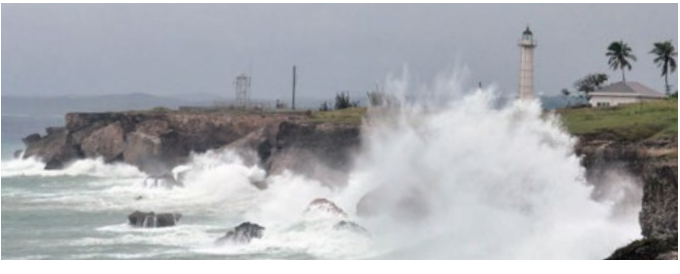
Waves crash against the rocks near the light house on U.S. Naval Station Guantanamo Bay, Cuba.

As we head into hurricane season, we remember the devastating category-two storm that pummeled U.S. Naval Station Guantanamo Bay Oct. 25, 2012.