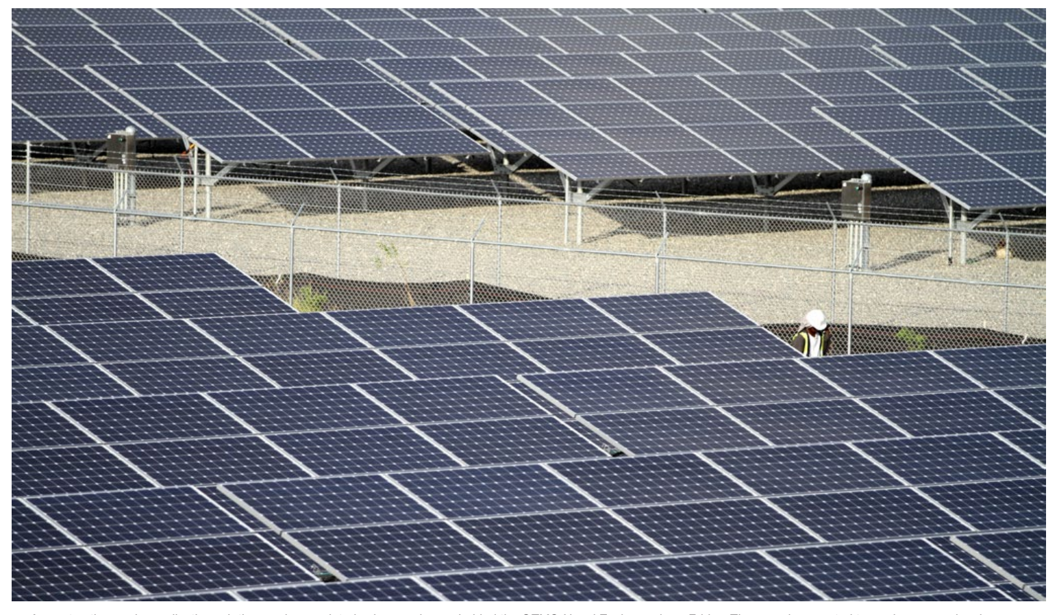
A construction worker walks through the nearly completed solar panel array behind the GTMO Naval Exchange here Friday. The array is expected to produce enough solar power to supply almost the entire Naval Exchange during daylight hours.

U.S. Naval Station Guantanamo Bay is looking at new ways to cut costs in a more fiscally restrained environment while maintaining mission capability. One of the major spending items for all services is utilities and the production of energy. This is part one of a series called "A Renewable GTMO" that will delve into what GTMO is doing to lead in the field of renewable energy.