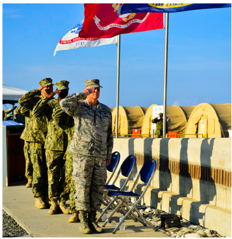
Air Force Brig. Gen. Ron Paul, deputy commander of Joint Task Force Guantanamo, joins outgoing JTF Maritime Security Detachment's Coast guard Cmdr. Ronzelle L. Green, commander of the 308th Port Security Unit, and incoming JTF MARSECDET officer-in-charge Coast Guard Cmdr. Jim R. Hotchkiss, commander of the 313th PSU, in saluting the colors during the National Anthem at the transfer of authority ceremony held at Camp Justice Monday, Sept. 28.

U.S. Naval Station Guantanamo Bay, Cuba, is known by many for its beautiful, blue ocean waters. All waterways, however scenic, are also an infinite source of potential danger and possible highway for those up to no good.