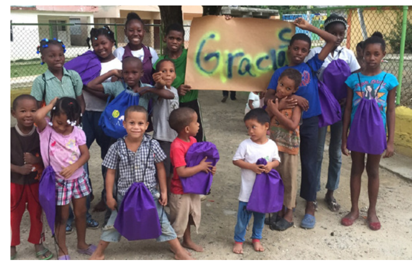
Children in Jacaguas, Dominican Republic, pose with a "thank you" sign. They are a part of the "Fundacion Sigue Mis Pasos."

programs for the orphanage and children of the community."