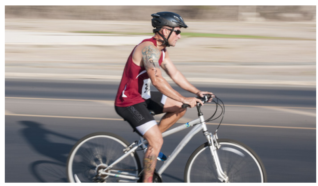
A service member rides his bike while completing the 40K bicycle portion, during the Olympic Triathlon at U.S. Naval Station Guantanamo Bay, Cuba, on Sept. 26. The triathlon, sponsored by the Morale, Welfare & Recreation program, created a bigger challenge compared to the previously held Sprint Triathlon, a month ago.

Participants competed in an Olympic Triathlon at U.S. Naval Station Guantanamo Bay, Cuba, on Sept. 26. The triathlon, which was sponsored by the Morale, Welfare & Recreation, took on a bigger challenge compared to the previously held Sprint Triathlon, which took place a month ago.