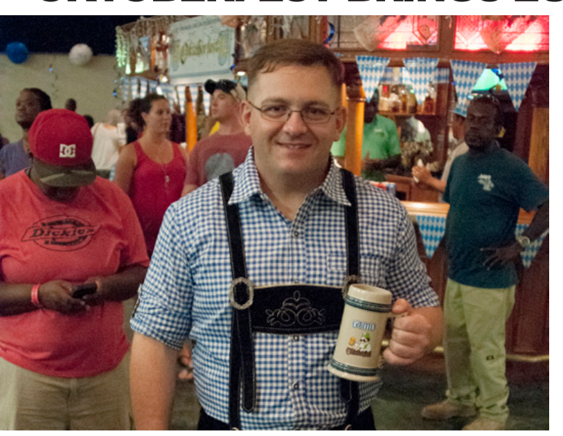
A partygoer at Oktoberfest shows off his lederhosen and beer stein. Germanstyle beer steins were available for purchase during the Oktoberfest celebration, Sept. 26, at The Windjammer at U.S. Naval Station Guantanamo Bay, Cuba.

Troopers and their families gathered, Sept. 26, at The Windjammer at U.S. Naval Station Guantanamo Bay, Cuba, for the annual Oktoberfest celebration, a festival of food, dancing and music.