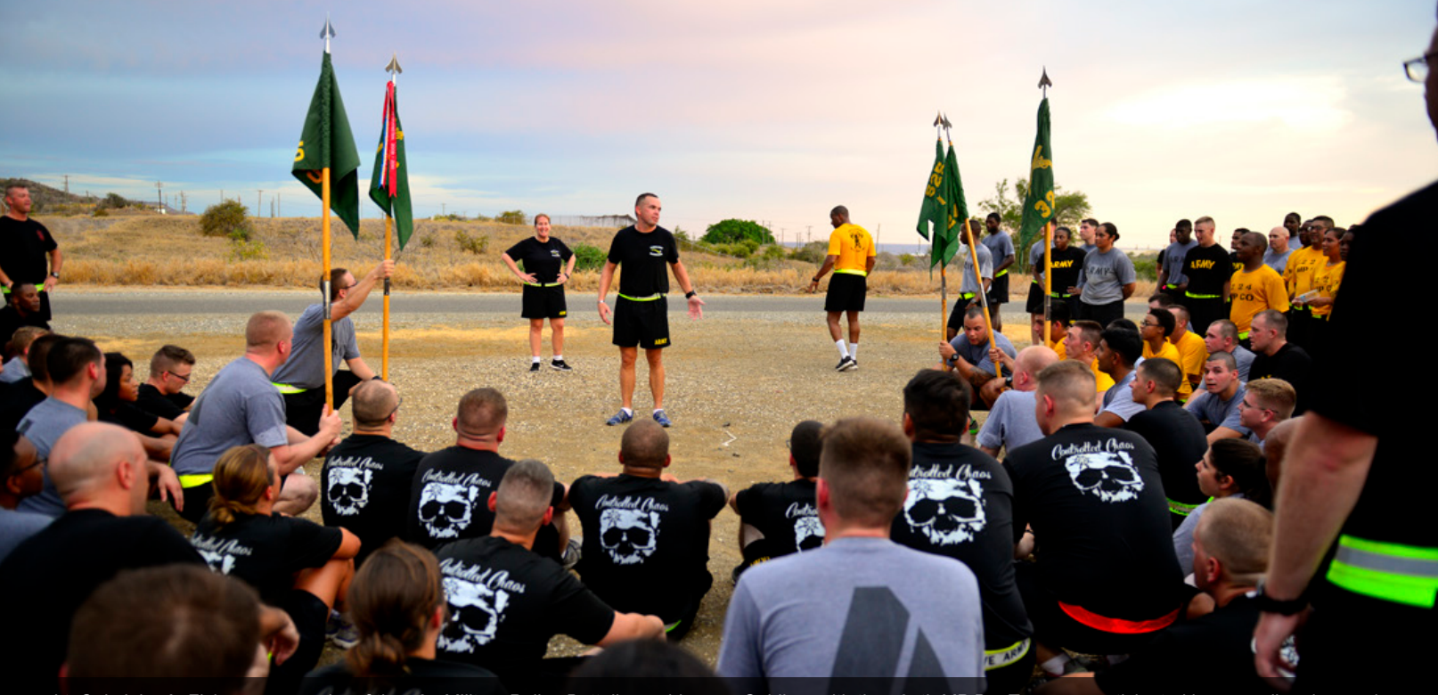
Lt. Col. John A. Fivian, commander of the 525 Military Police Battalion, addresses Soldiers with the 525th MP Bn. Troopers participated in a 74-mile relay run in celebration of the MP Corps' 74th birthday, Sept. 25-26, at U.S. Naval Station Guantanamo Bay, Cuba.

Most 74-year-old's do not celebrate their birthday by running 74 miles, unless they are the entity known as the U.S. Army's Military Police Corps. Starting around 6 p.m. last Friday, members of the 525th Military Police Battalion with Joint Task Force Guantanamo picked up their battalion colors and commenced running, only stopping when the 74 miles were complete.