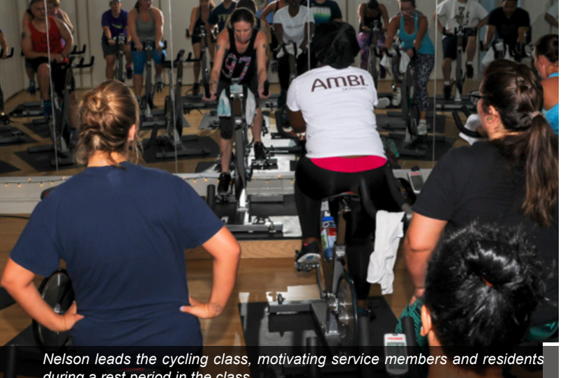
during a rest period in the class.