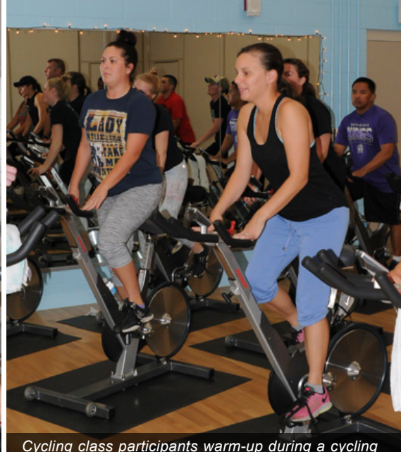
Cycling class participants warm-up during a cycling class at the G.J. Denich Gym on Jan. 14.