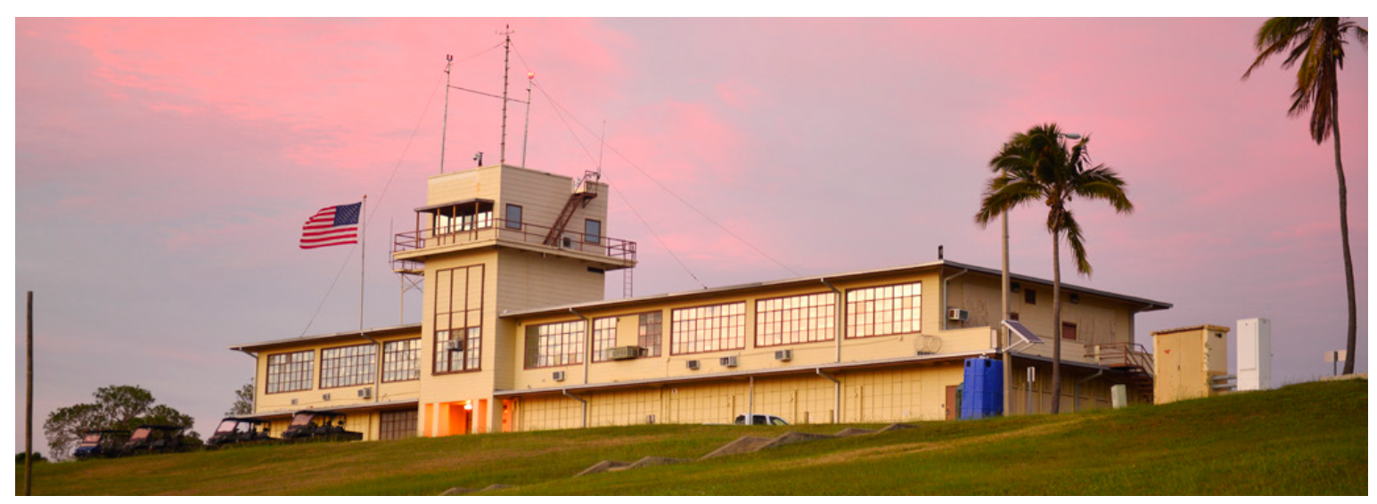
The Expeditionary Legal Complex at U.S. Naval Station Guantanamo Bay, Cuba, is operated in part by the Commissions Liaison Office, which offers a free flag-flying service for Joint Task Force Guantanamo Troopers and NAVSTA residents.

Old Glory, the Stars and Stripes, the red, white, and blue; The American Flag has many names and over the last two and a half centuries it has changed many times, but few things so clearly symbolize our nation and its military men and women. It is, perhaps, odd to think of a flag as a souvenir. In military families especially, a folded flag often means the loss of a loved one, or the conclusion of an honorable career.