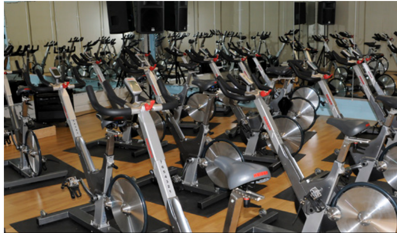
The spinning bikes sit alone upon completion of the cycling class for Joint Task Force Guantanamo Troopers and U.S. Naval station Station Guantanamo Bay, Cuba, residents.