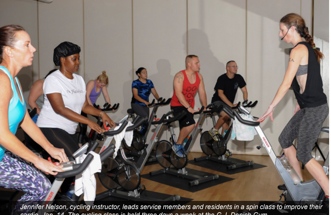
cardio, Jan. 14. The cycling class is held three days a week at the G.J. Denich Gym.